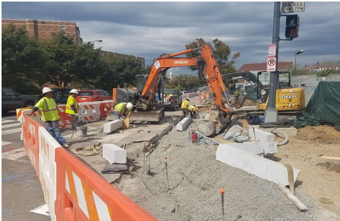
09/26/2019- Setting granite curb at NE corner of NJ Ave. & K St. NW. (North View)