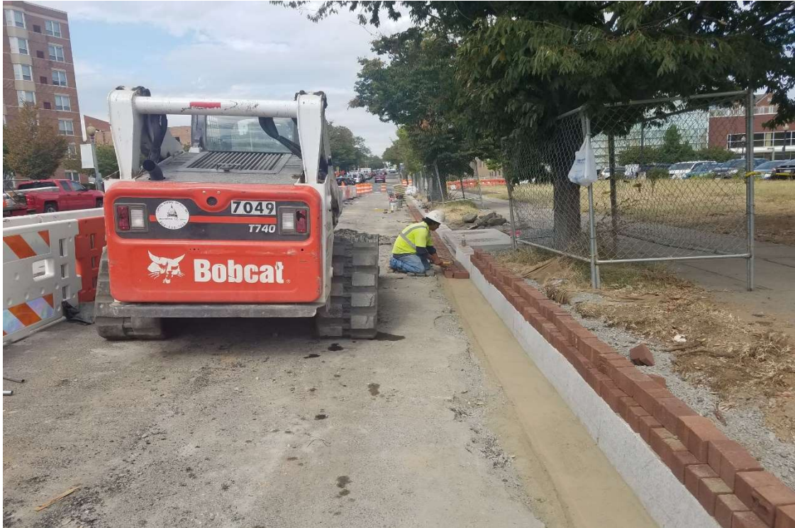
09/26/2019- Brick gutter construction at East side of NJ Ave. NW between K & I St. NW. (North View)