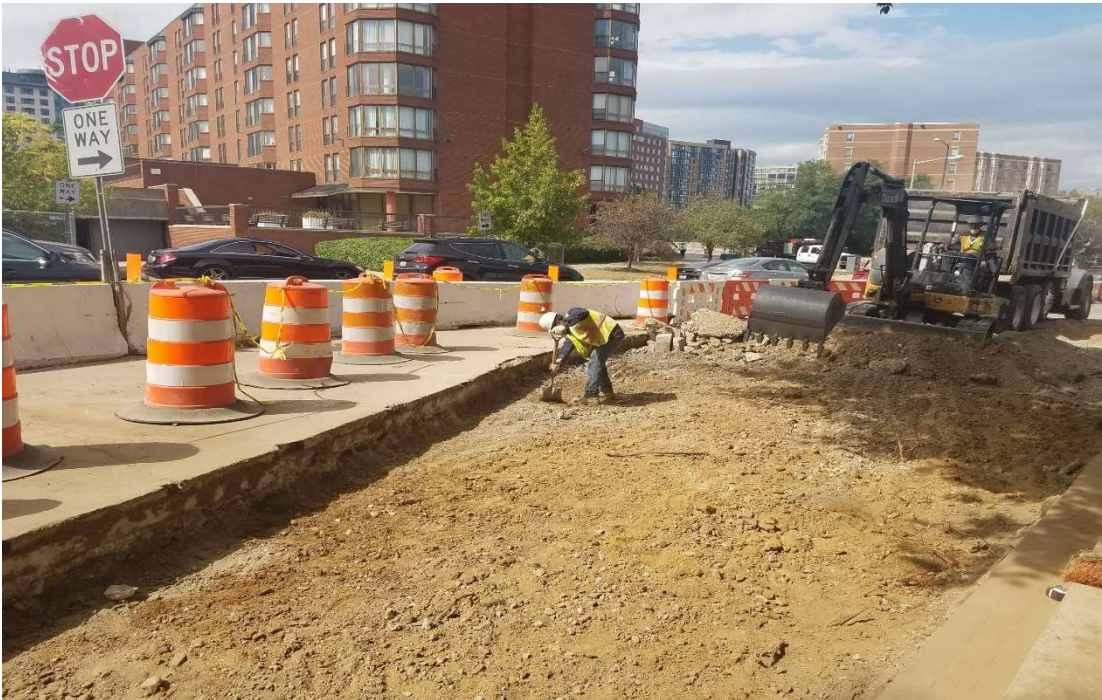
09/26/2019- Excavation to install PCC base at East side NJ Ave. b/n K & I St. NW.(NW view)