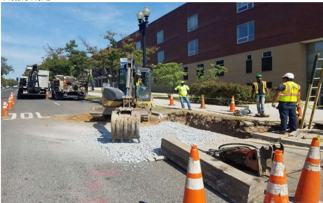
09/23/2019 – Excavation for Structure P placement at East side of NJ, north of L St. NW. (North View)