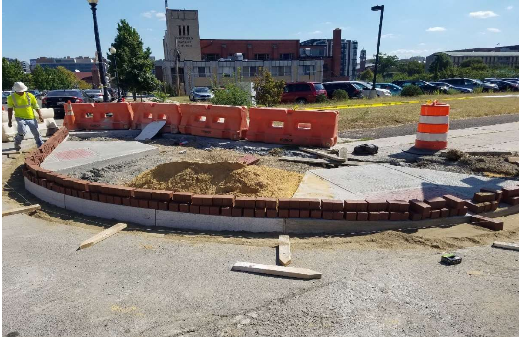
09/25/2019 – Wheelchair/Bicycle Ramp Constructed at SE Corner of NJ and L St. NW. (East View)