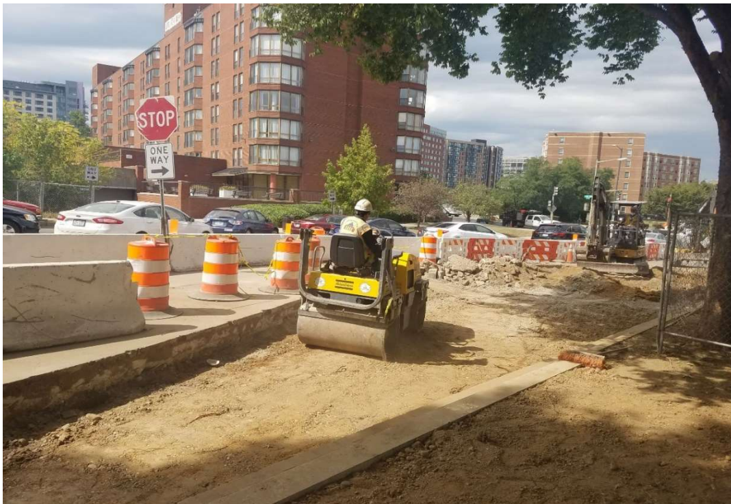
09/26/2019 – Compaction to the subgrade at East side of NJ Ave. between K & I St. NW. (North View)