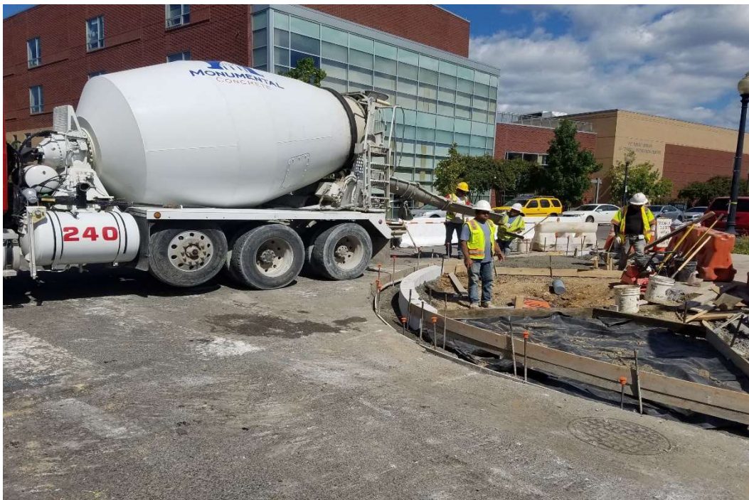
09/24/2019 – Concrete pouring for Wheelchair/Bicycle Ramp at SE corner of NJ & L St. NW. (East View)