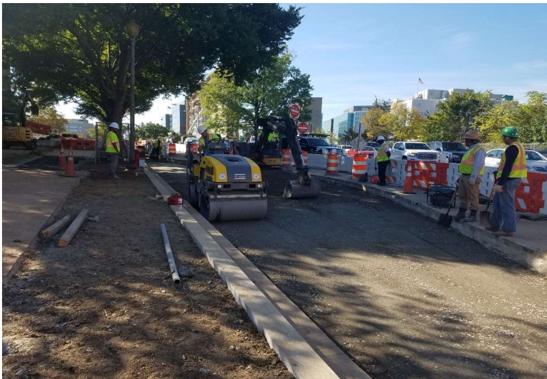
09/26/2019 - Compaction to Aggregate Base Course placed at East side of NJ Ave. b/n K & I St. NW.

Project Website: www.newjerseyaverehab.com