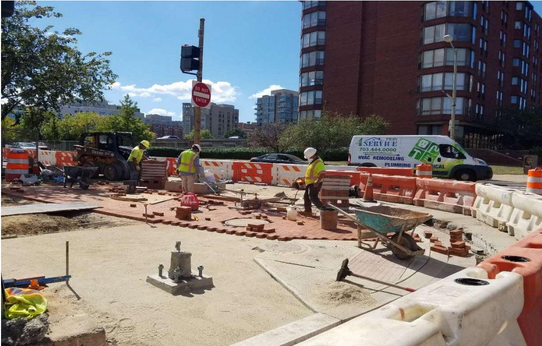
09/24/2019- Brick sidewalk construction at SE Corner of New Jersey Ave. & K St. NW. (West View)