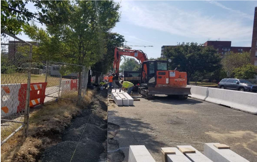
09/23/2019- Setting Granite Curb at East side of NJ Ave. NW between K & L St. NW (South View)