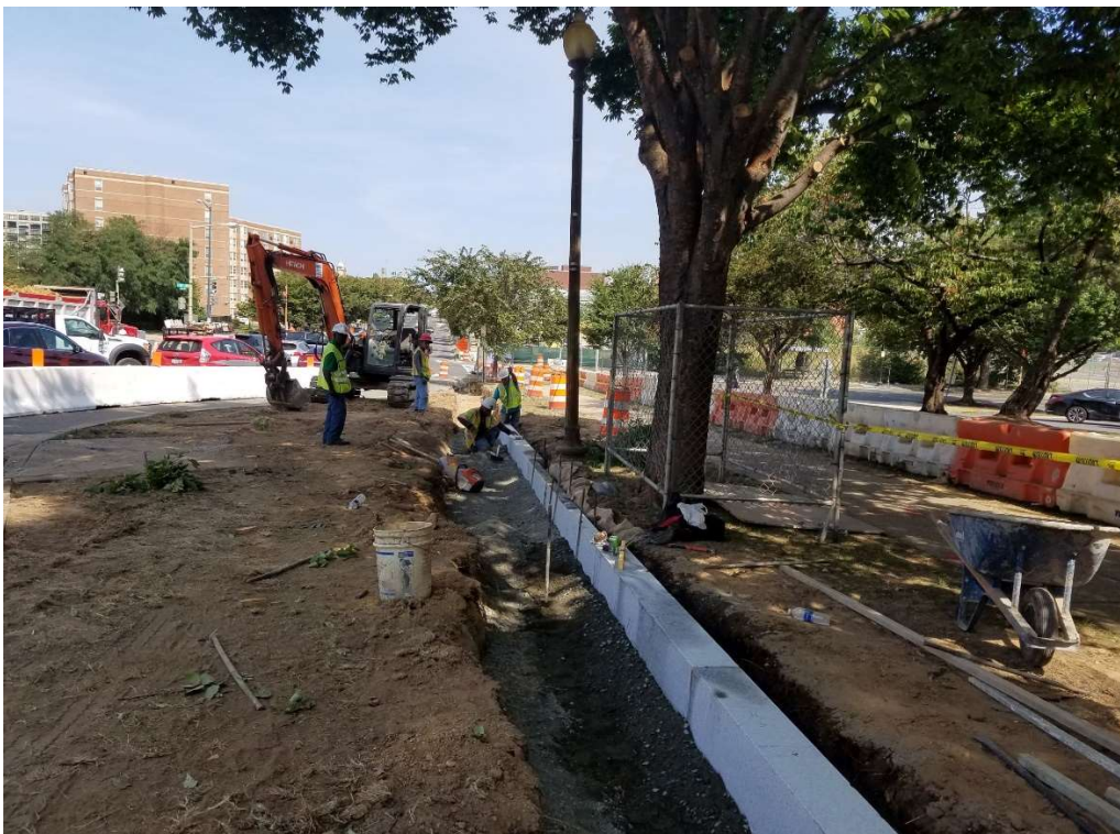
09/10/2019 –Installing Granite curb along East side of NJ between K & I St. NW. (South View)

Project Website: www.newjerseyaverehab.com