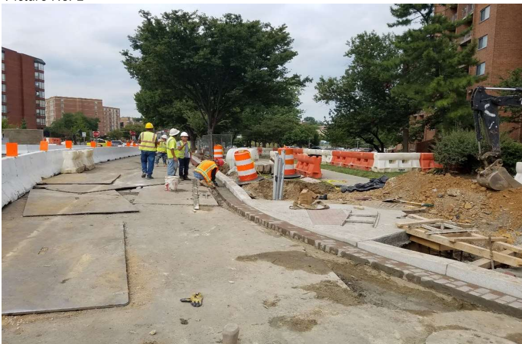
09/09/2019 – Brick gutter construction at NE corner of NJ & I St. NW (NE view)