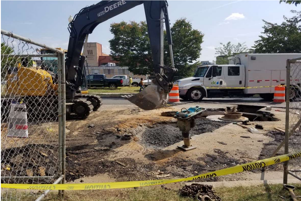
09/10/2019- Backfill to PCC connect pipe around structure Q2 (West View)