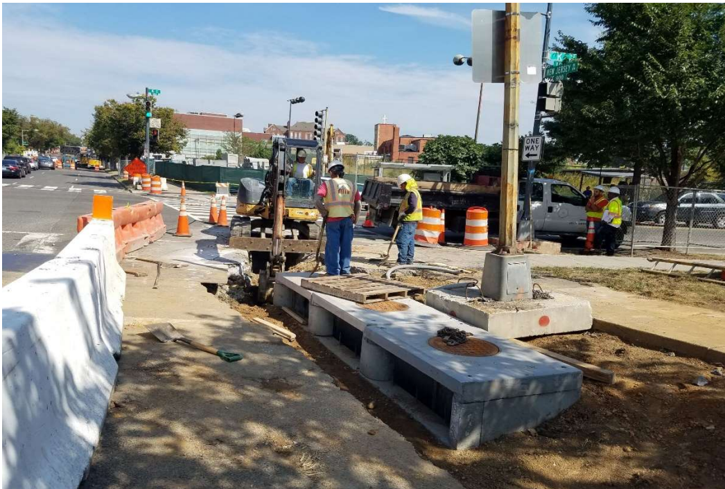
09/12/2019 – New Triple Catch Basin Installed at SE Corner of NJ Ave. & K St. NW (South View)