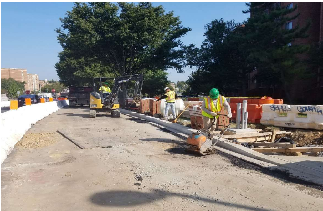
09/11/2019 – Compaction to Temporary Asphalt Placed along the edge of brick gutter at NE corner of NJ & I St. NW. (South View)