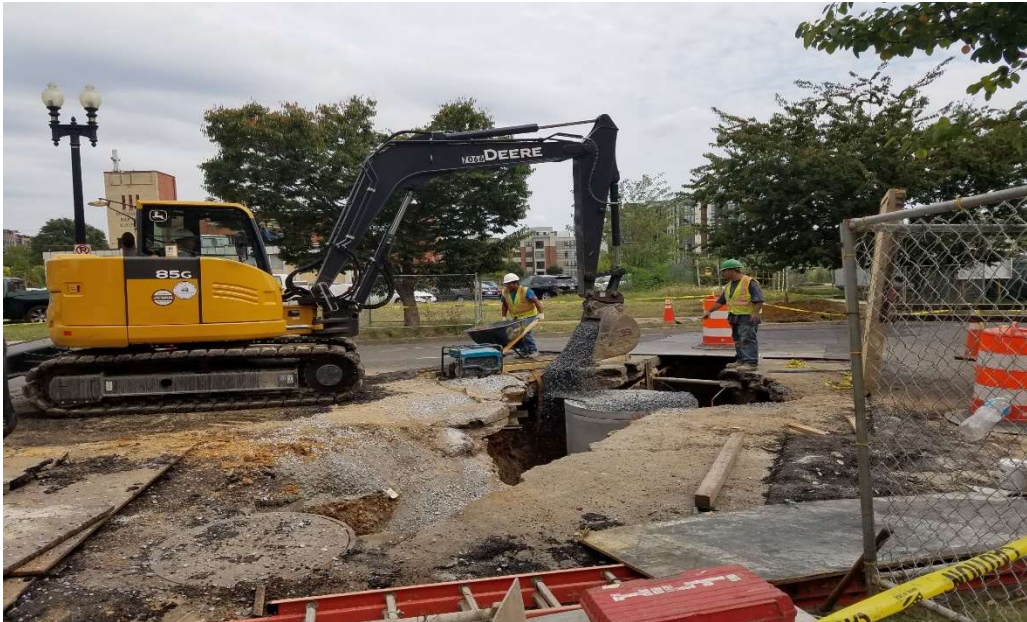
09/09/2019- Filling GAB around Structure Q2 at NJ Av e. NW between L & K St. NW (West View)