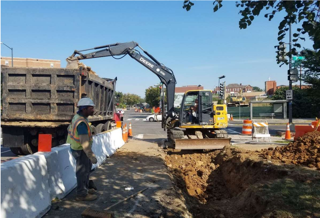
09/11/2019 – Excavation to install triple catch basin S1 at SE corner of NJ & K St. NW. (South View)