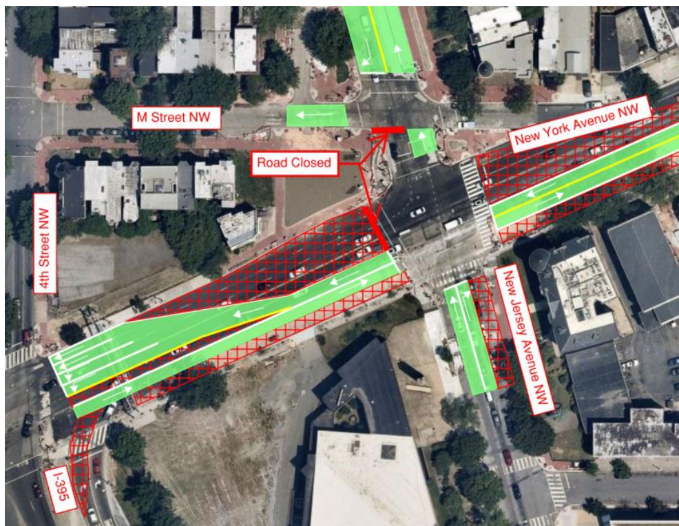
Figure 2: Westbound Detour at New York Ave NW and New Jersey Ave NW

For more information about the Safety Improvements on New Jersey Avenue NW project and to stay up-to-date on traffic related impacts and construction progress, please visit www.newjerseyaverehab.com .