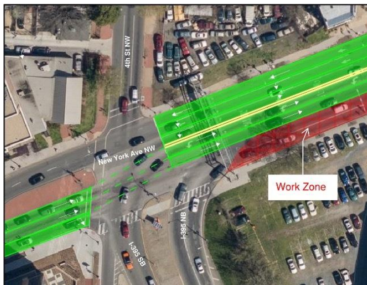
Intersection of New York Avenue NW, 4 th Street NW, and I-395