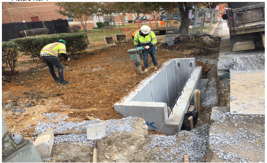
11/14/2019- Installing catch basin R1 along on west side NJ Ave between K St and L St (north View)