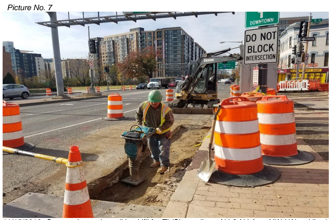
11/15/2019- Compaction to the soil backifll for TL/SL condits at NJ & NJ Ave. NW (West View)