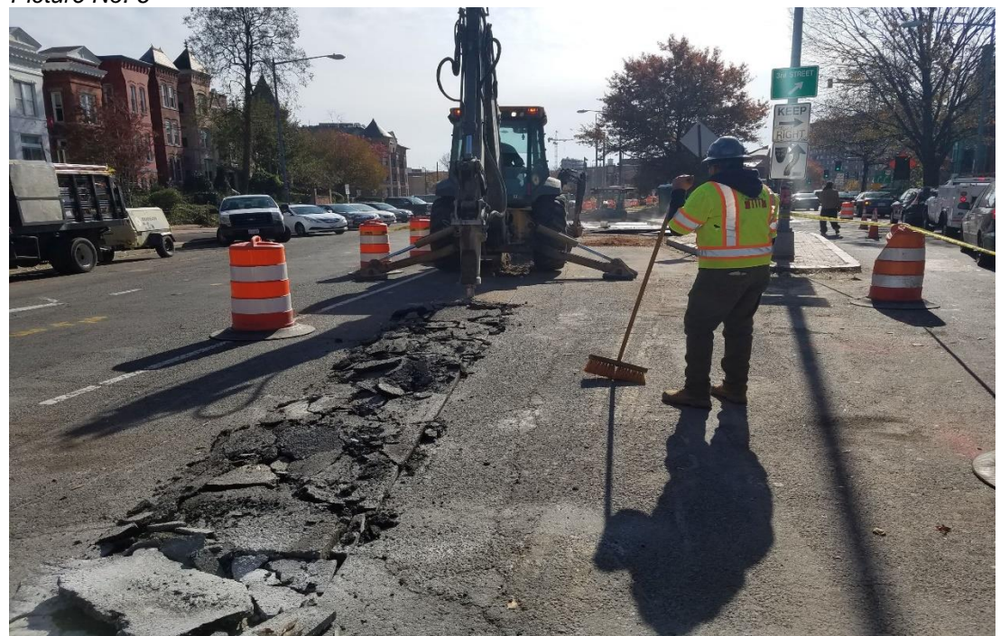
11/15/2019 – Trench excavation to install SL conduits at NJ Ave. NW between N & Morgan St. NW. (South view)