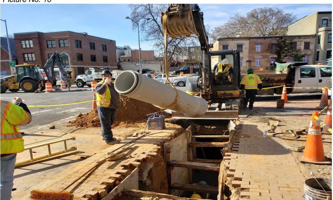
11/15/2019- Installing 18" Connect pipe between existing MH & MH-A4 at NE corner of Morgan & NJ Ave. NW.