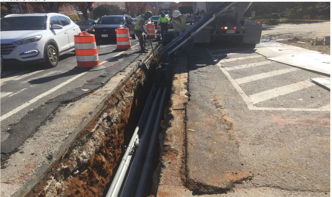
11/16/2019- Concrete pouring to encase streetlight conduit between MH-1 & MH-2 at NJ Ave. between N St. & Morgan St. NW.