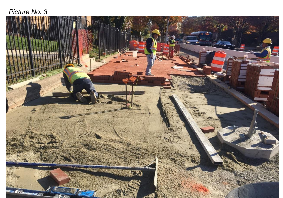
11/13/2019- Brick sidewalk construction at East side of NJ Ave. NW between Pierce St. & NY Ave. (South View)