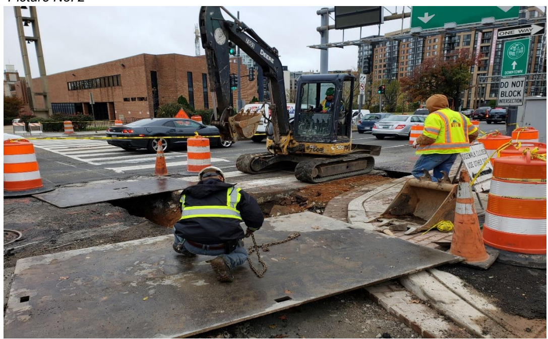
11/12/2019-Safety measures to the trench excavated for electrical conduits at NW corner of NJ & NY. (SW view)