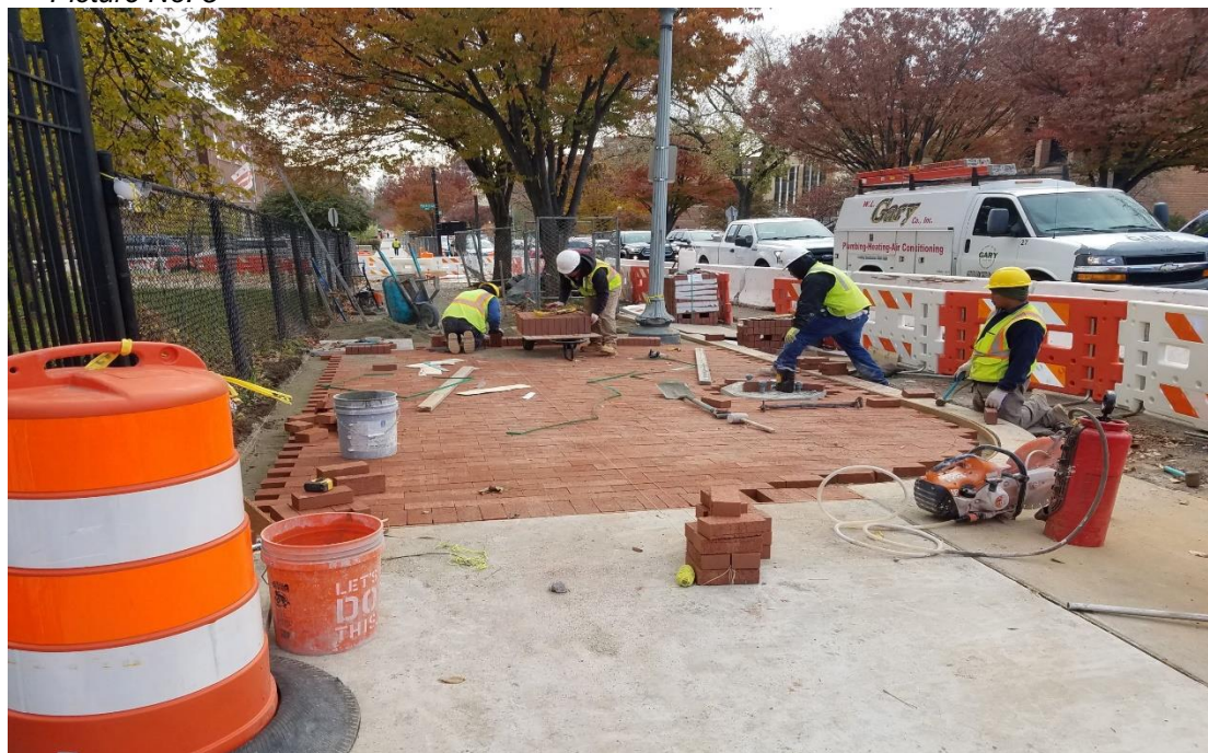
11/14/2019- Brick sidewalk construction at East side of NJ Ave. NW between Pierce St and NY Ave. (South view)