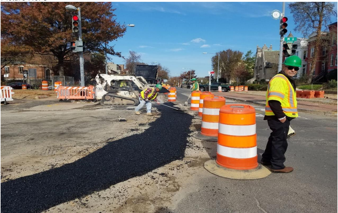
11/15/2019- Repairs to the roadway/trench line excavated for conduit installation at NJ Ave between NY & M Morgan St. NW. (North View)