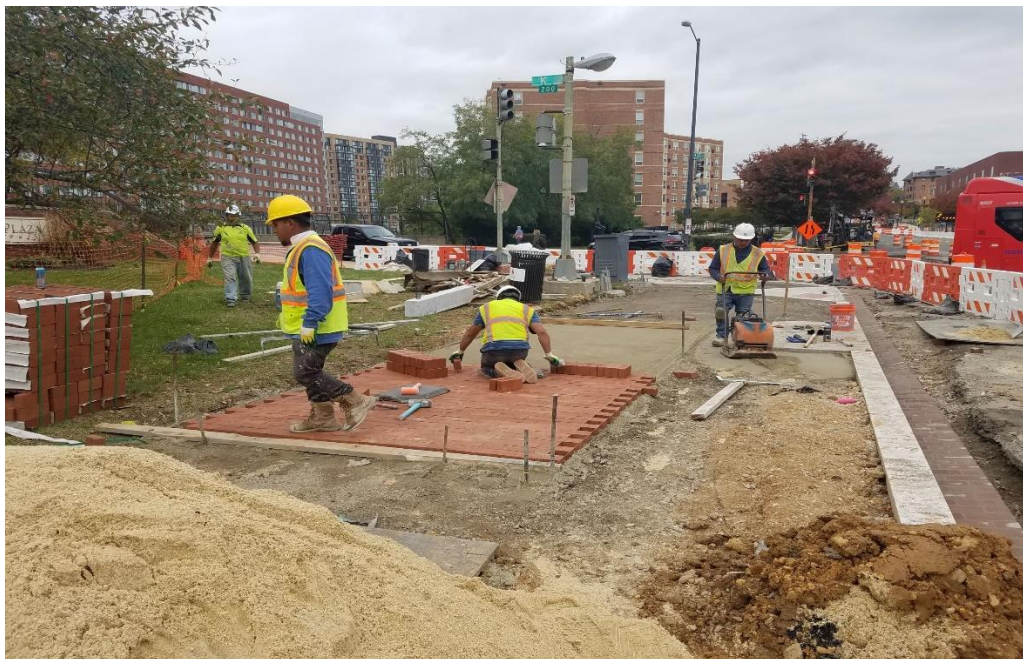
10/29/2019- Brick sidewalk construction at West side of NJ Ave, South of K St. (North View)