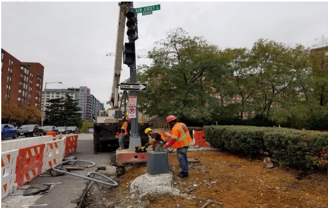
10/30/2019-Relocate Traffic Signal on Temporary Base at NW corner of NJ Ave. & K St. NW. (West view)