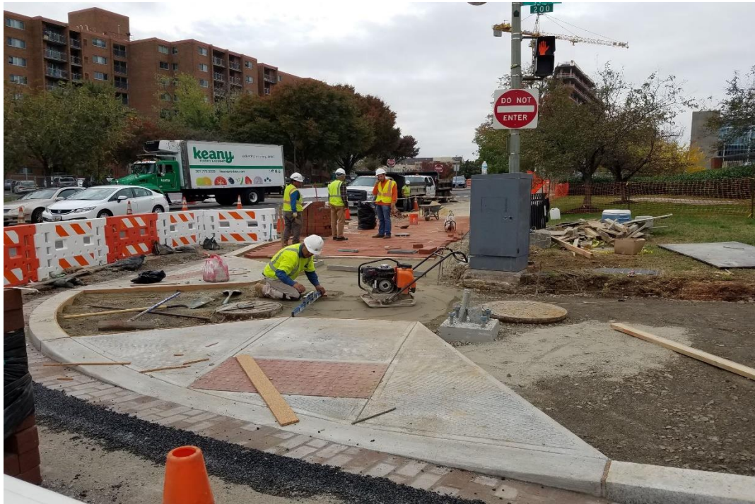
10/30/2019-.Brick sidewalk construction at SW corner of New Jersey Ave & K St. NW (South view)