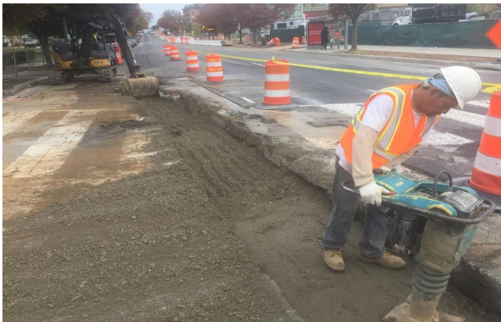
10/29/2019- Compaction to the soil backfill for electric conduits buried at SW corner of NJ & K St. NW.