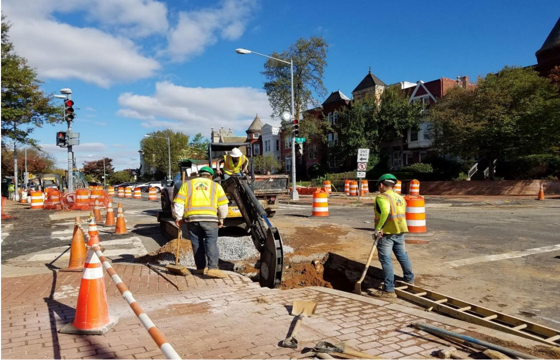
11/01/2019- Excavation for streetlight manholes at NJ Ave. NW between NY & Morgan St. (North view)