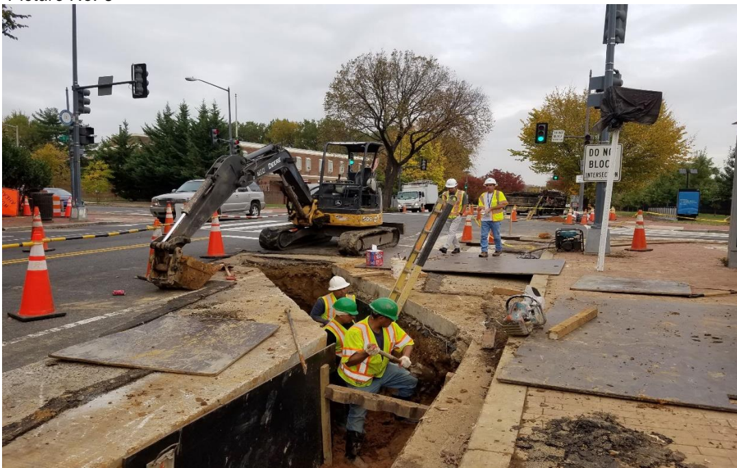
10/30/2019 – Preparing for water main shut down at NJ Ave. near N St. NW. (South view)