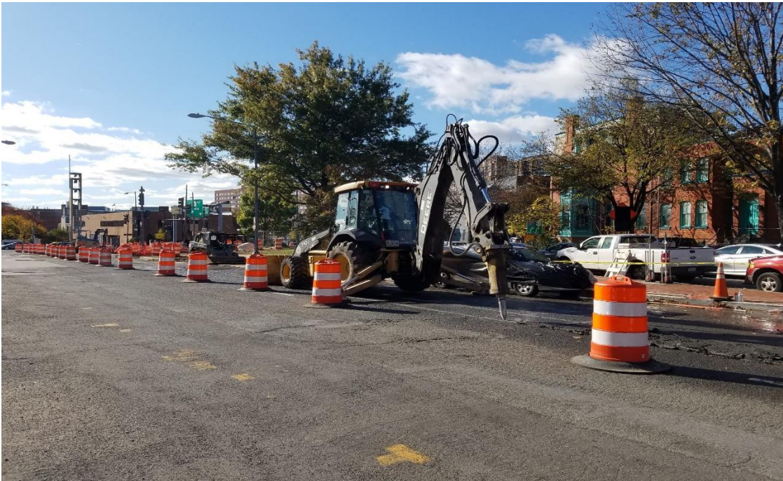
11/01/2019- Excavation for streetlight conduit at NJ Ave. NW b/n Morgan and NY Ave. (Southwest View)