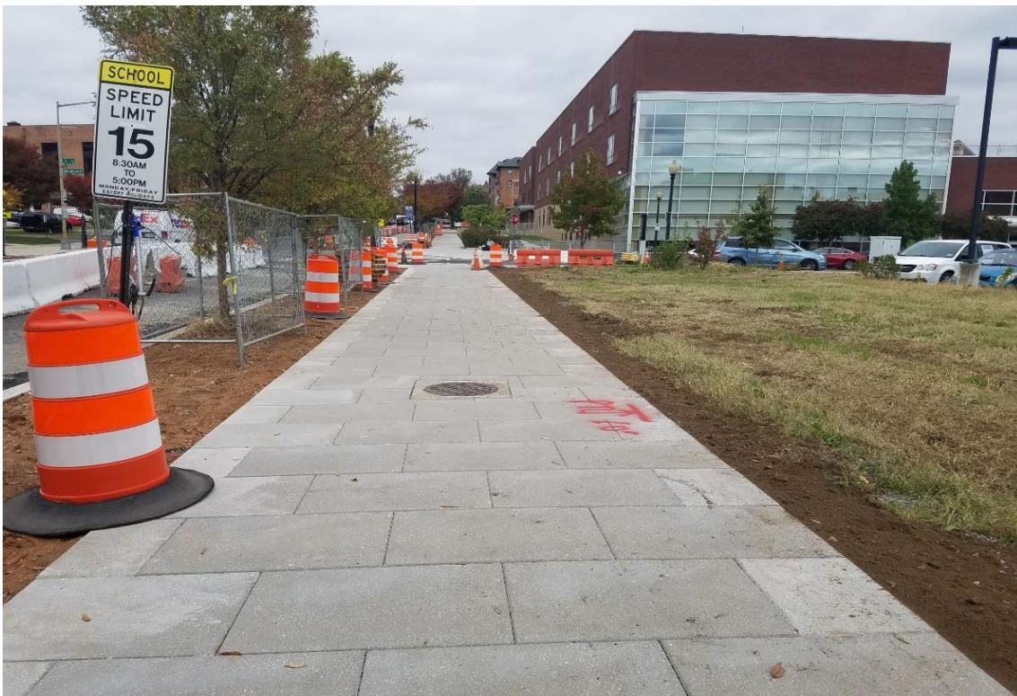
10/29/2019- New block paver sidewalk on east side of NJ between K & L St. NW. (North view)

Project Website: www.newjerseyaverehab.com