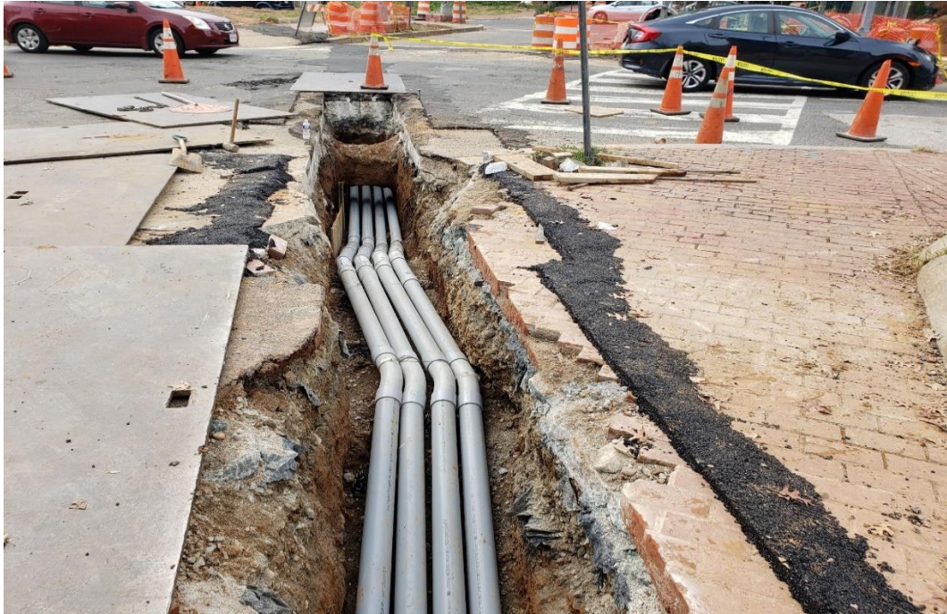
10/30/2019- Traffic Signal conduit installed at/near New Jersey Ave. & M St. NW. intersection.