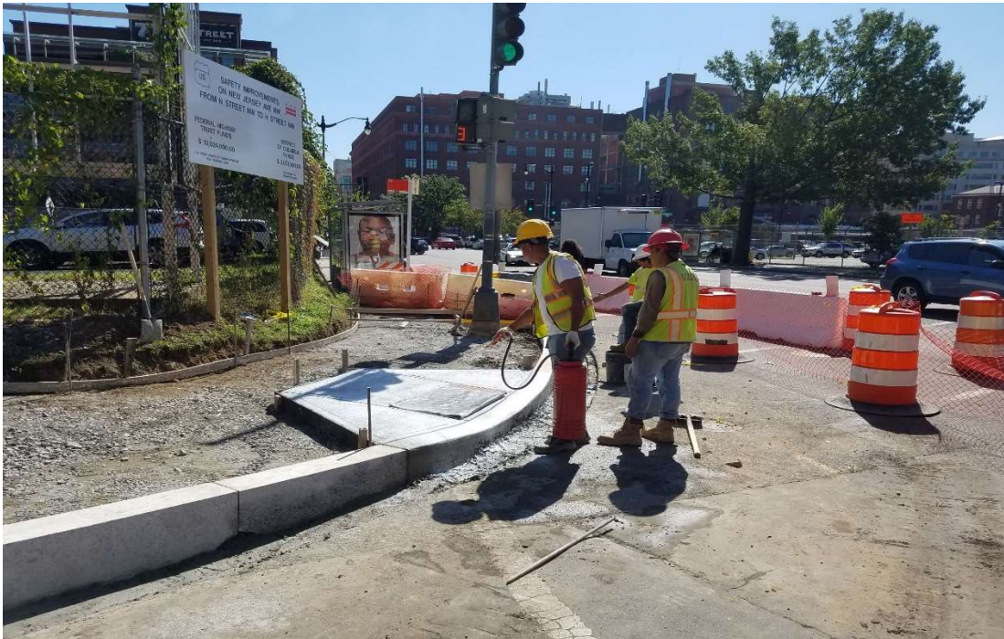
08/29/2019 – Curing compound application to the newly constructed PCC Wheelchair Ramp at NE corner of NJ Ave. & H St. NW. (East View)