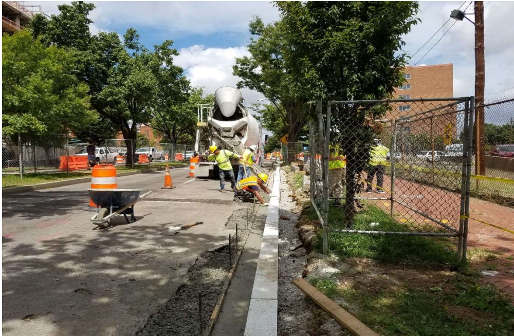
08/26/2019- PCC Base for gutter at East side of NJ between H and I St. NW. (North View)