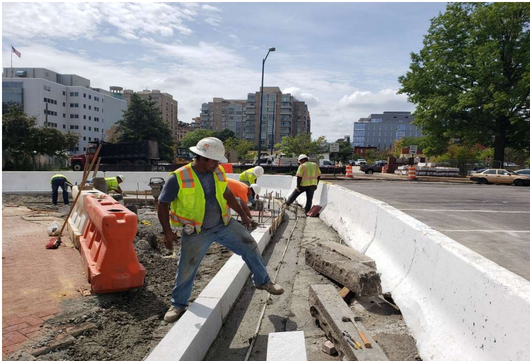
08/27/2019 – Installing granite curb at SE corner of NJ Ave. & I St NW. (West view)