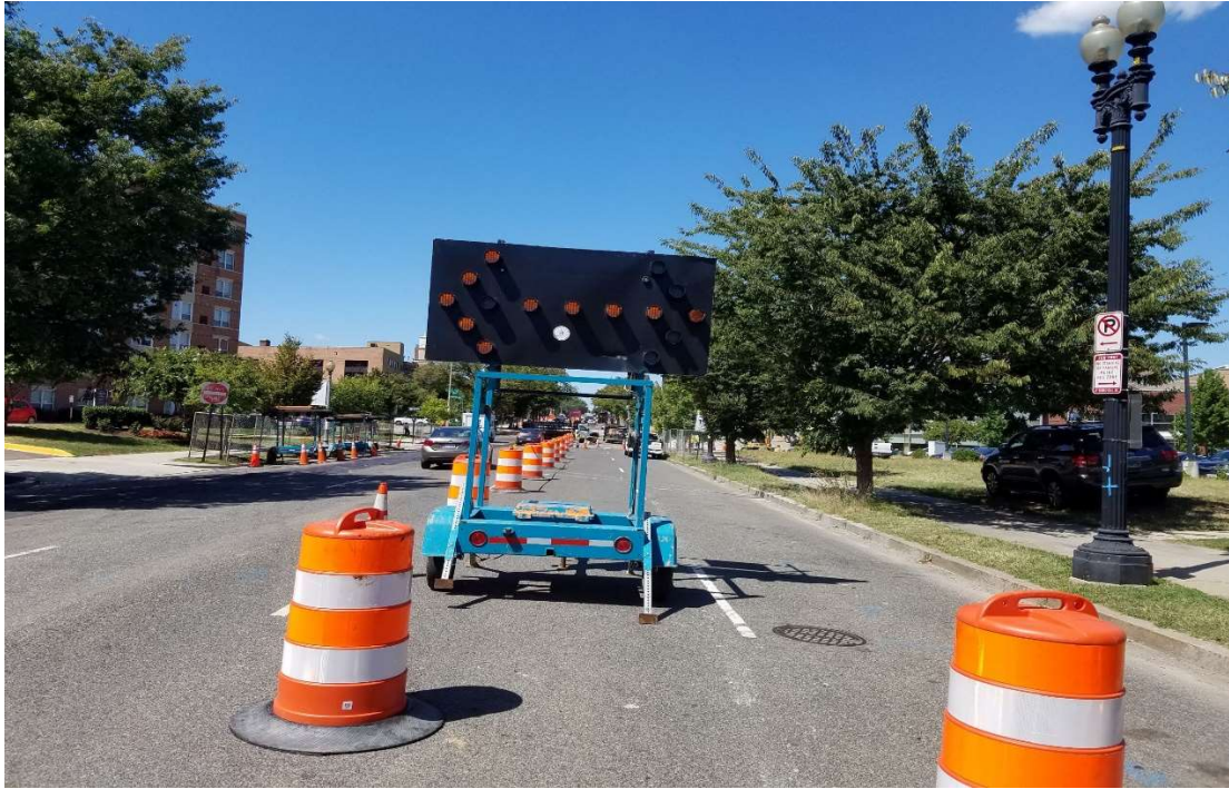
08/29/2019 - MOT set up at New Jersey Ave. NW between K & L.St NW (North View)