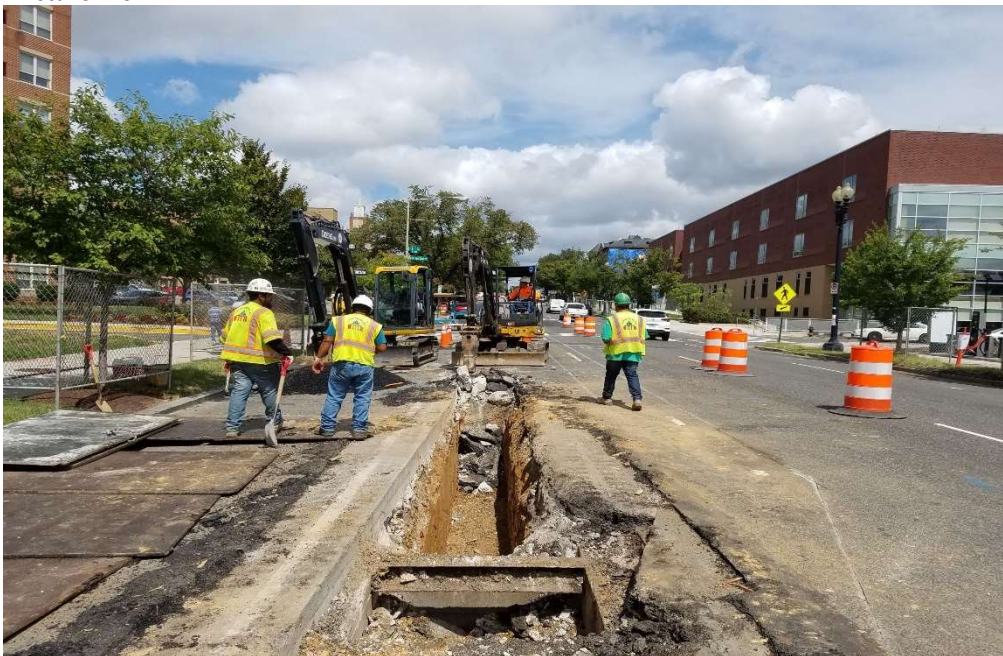
08/26/2019 – Trench excavation for Street light conduit between K & L St. NW. (North view)