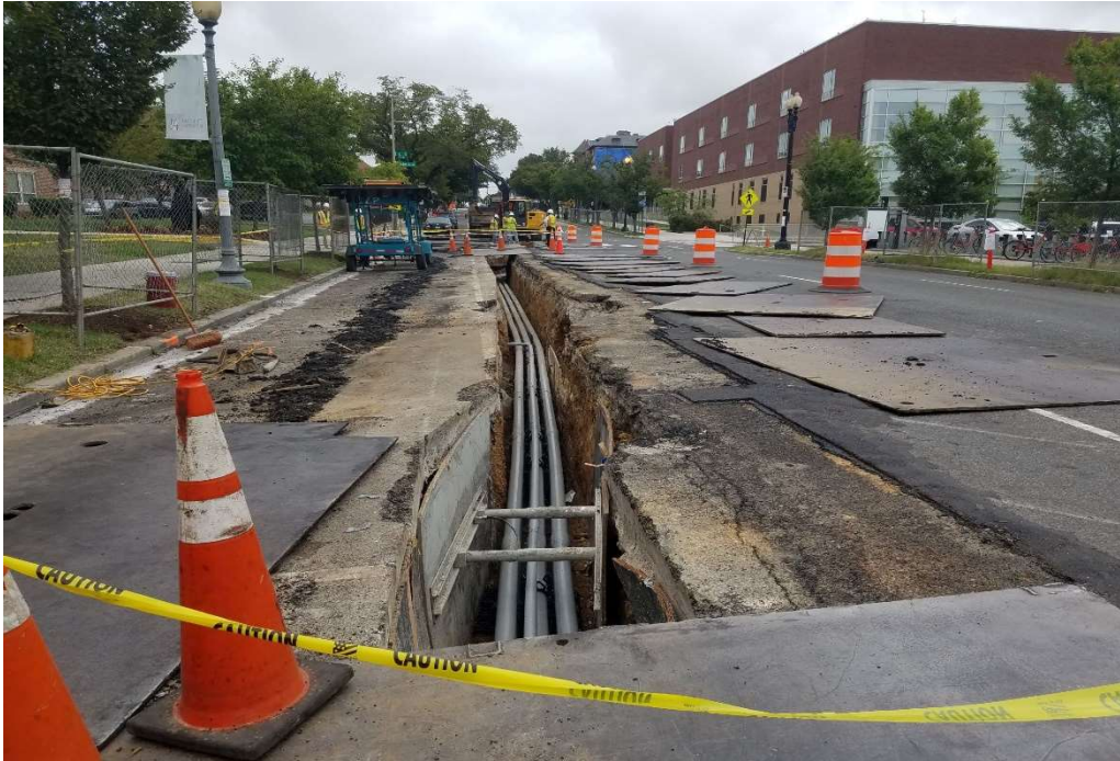
08/28/2019- Installed PVC conduit for duct bank at NJ Ave. NW between K & L St. NW. (North View)