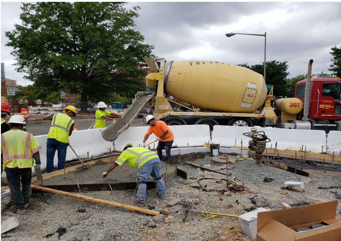
08/27/2019 –Constructing PCC Wheelchair Ramp at SE corner of NJ Ave. & I St. NW. (North view)

Project Website: www.newjerseyaverehab.com