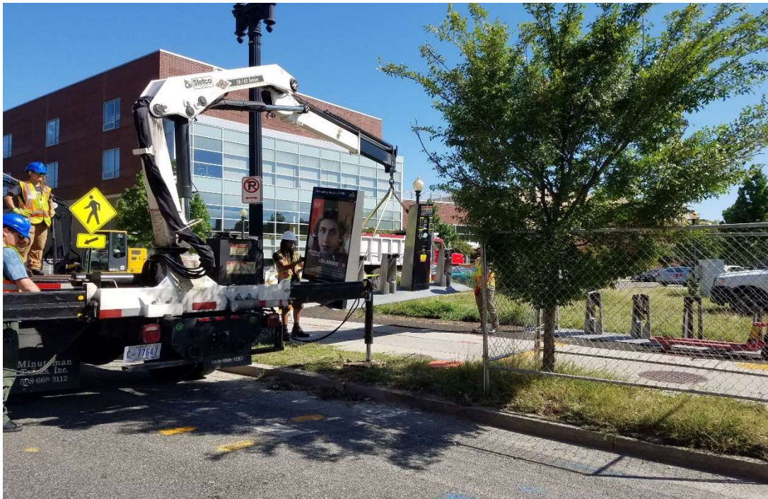
08/29/2019 - Removal of Bike station at NJ Ave. NW between K & L St. NW (East View)