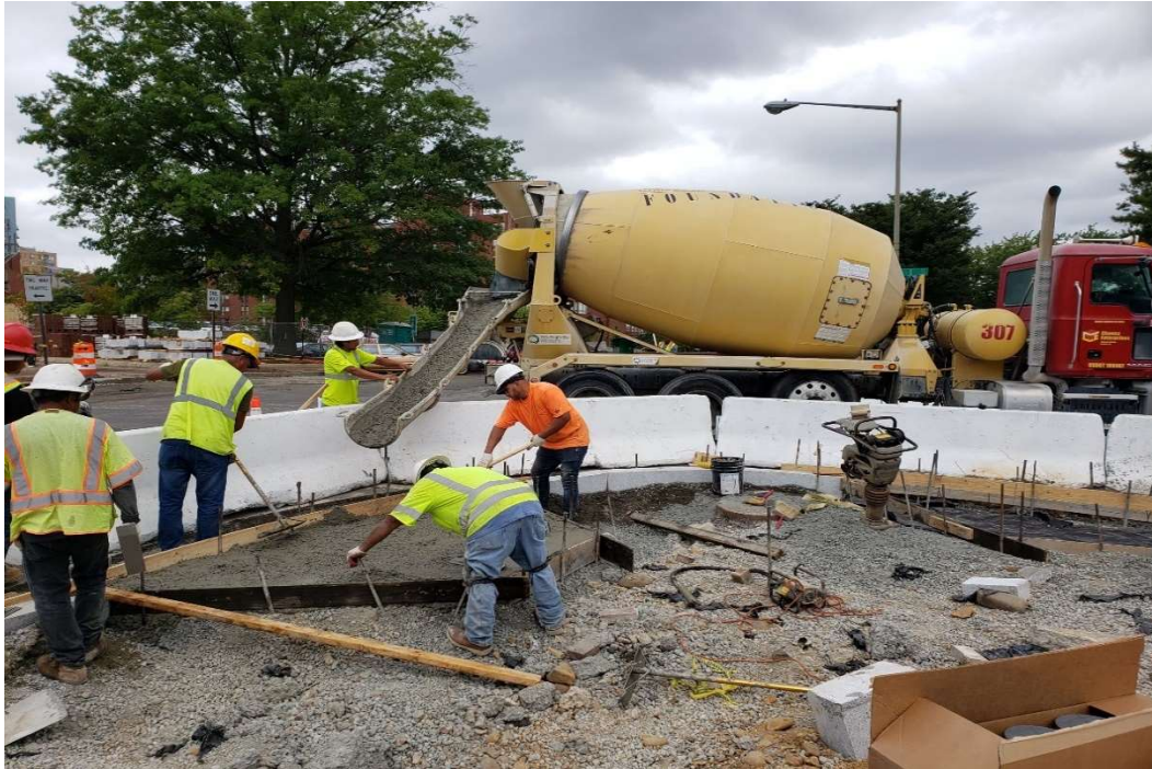
08/27/2019 – Constructing PCC Wheelchair Ramp at SE corner of NJ & I St. NW. (North View)