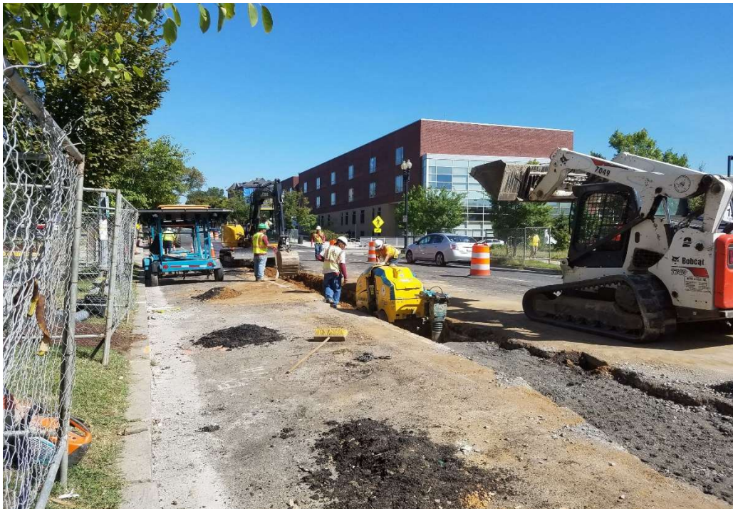
08/30/2019 – Backfill/compaction for duct bank at NJ Ave. NW between K & L St. NW. (NE view)