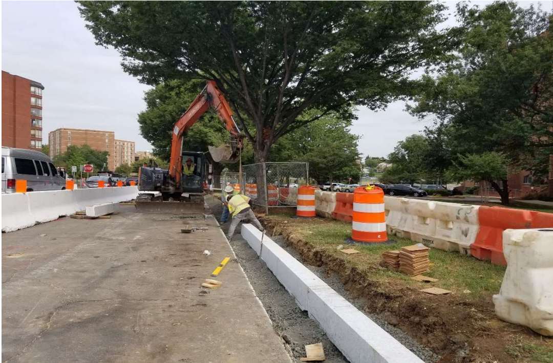
09/05/2019 – Installing granite curb at East side of NJ Ave. NW between K & I St. NW. (North View)