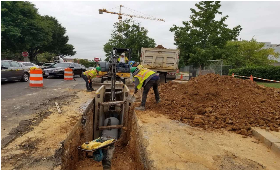
09/06/2019 – Installing 18" PCC Connect Pipe from Storm drain structure U4 to U1 at West side of NJ Ave. NW from K & I St. NW. (South View)