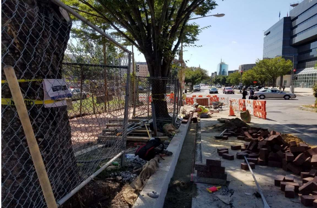
09/03/2019- Brick gutter construction at East side of NJ Ave. NW between H & I St. (South View)