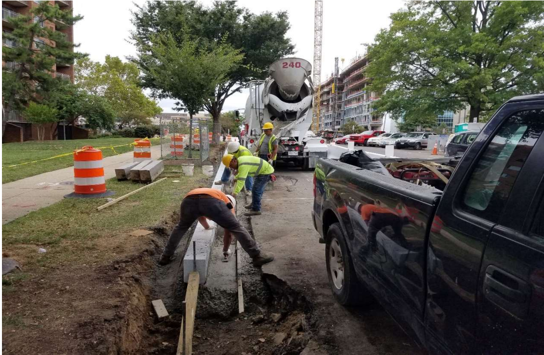
09/06/2019- PCC Base construction for brick gutter at West side of NJ from K to I St. NW (South View)