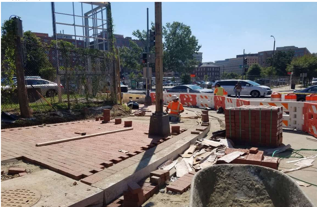
09/03/2019 – Brick sidewalk construction at NE Corner of NJ & H St. NW. (SE view)