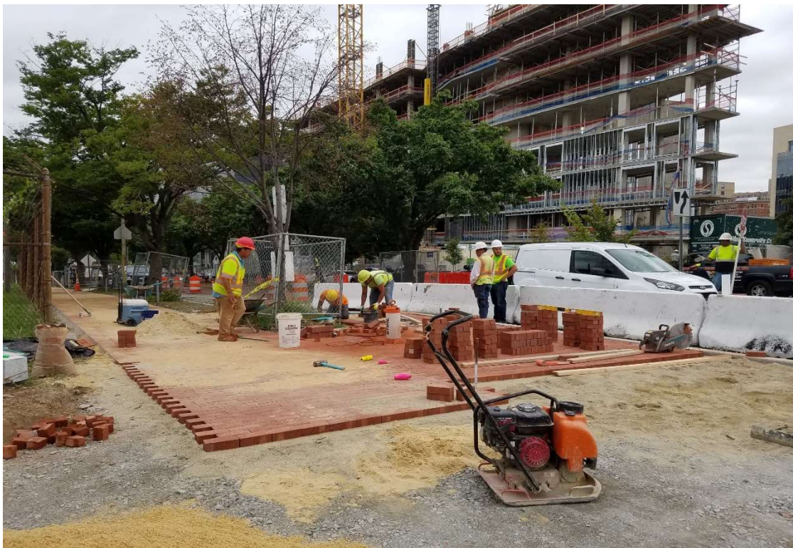
09/06/2019 –Brick sidewalk construction at/near SE corner of New Jersey & I St. NW. (SW View)

Project Website: www.newjerseyaverehab.com