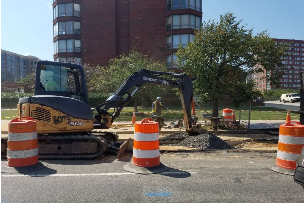
09/04/2019- Backfill for storm structure at west side of NJ between I & K. St. NW. (West View)