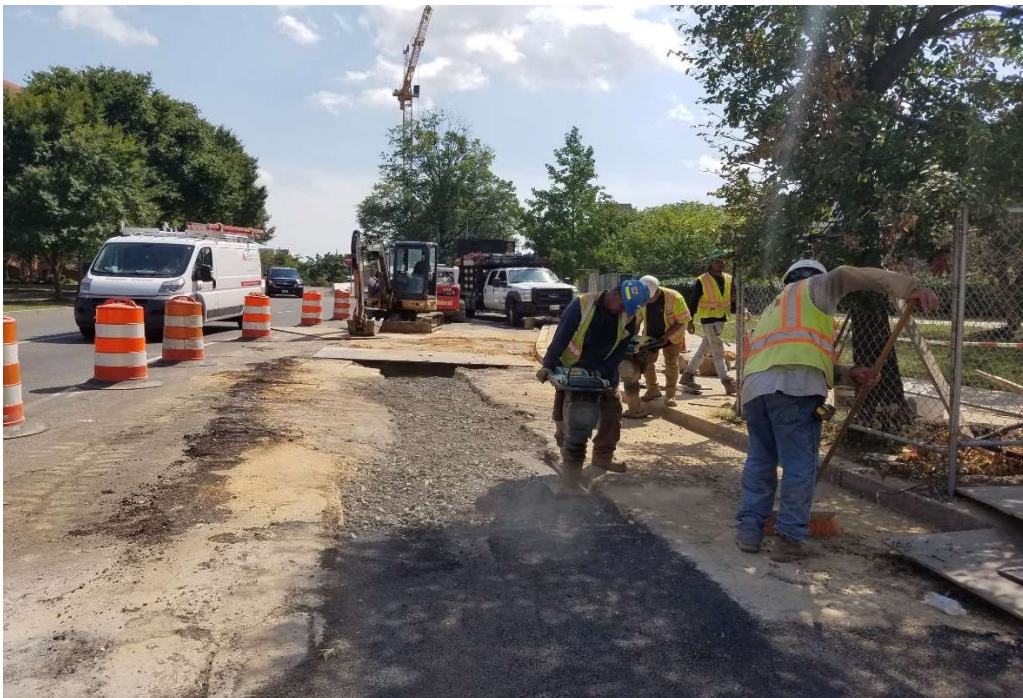
09/04/2019 – Backfill/compaction for storm structure at west side of NJ Ave. between K & I St. NW.