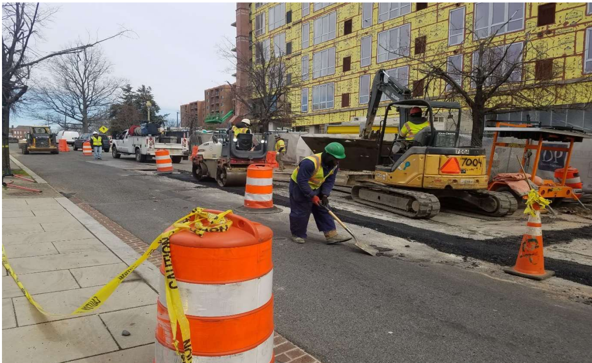
02/19/2020- Temp Asphalt Placement/compaction for over utility trench at 2 nd St. NW b/n H & I St. NW.