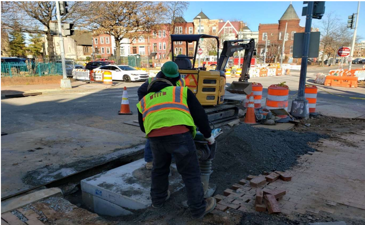
02/21/2020- Single Catch Basin installation at SW corner of M St and 3 rd St. (NE View)