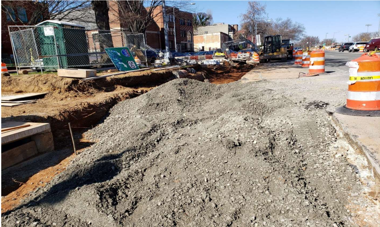
02/21/2020- Preparation for GAB at West side of NJ Ave NW b/n Morgan & M St. NW. (North View)