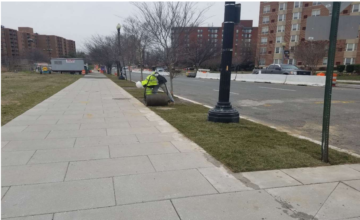
02/20/2020- Sodding activity at West side of New Jersey Ave. NW between K & L St. NW. (South view)