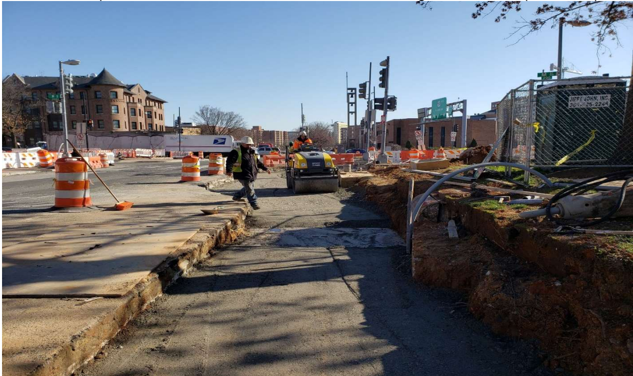
02/21/2020- GAB placement and compaction at West side of NJ b/n M & Morgan St. NW. (South View)