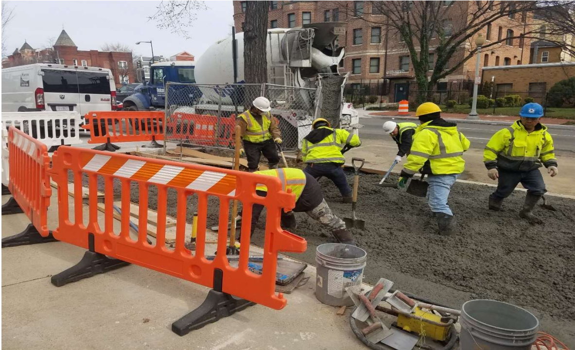
02/19/2020- PCC Base Construction for Block sidewalk at West side of NJ & Pierce St. (NW. view) Picture No. 6