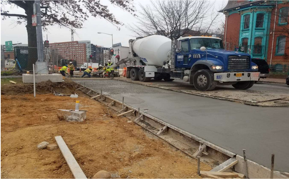
02/20/2020- PCC Base construction at 3 rd St./ M St. and NJ ave. Intersection. (Southwest View)