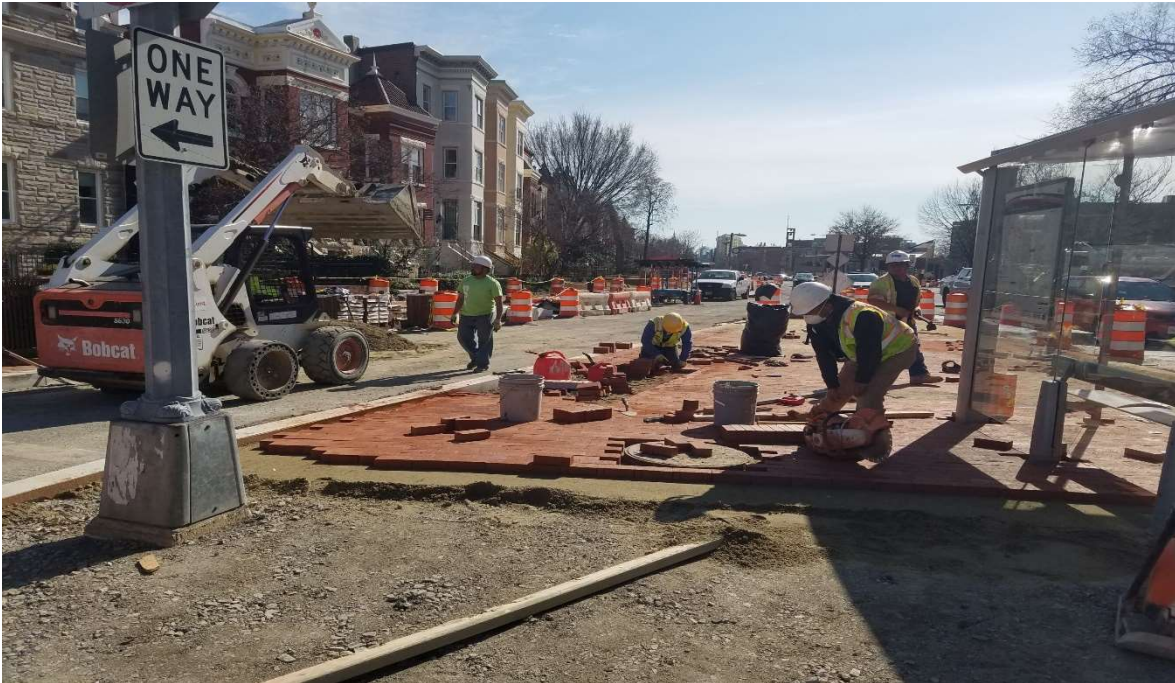
02/17/2020- Brick Sidewalk Construction at East side of New Jersey Ave. NW between Morgan & N St. (SE view)