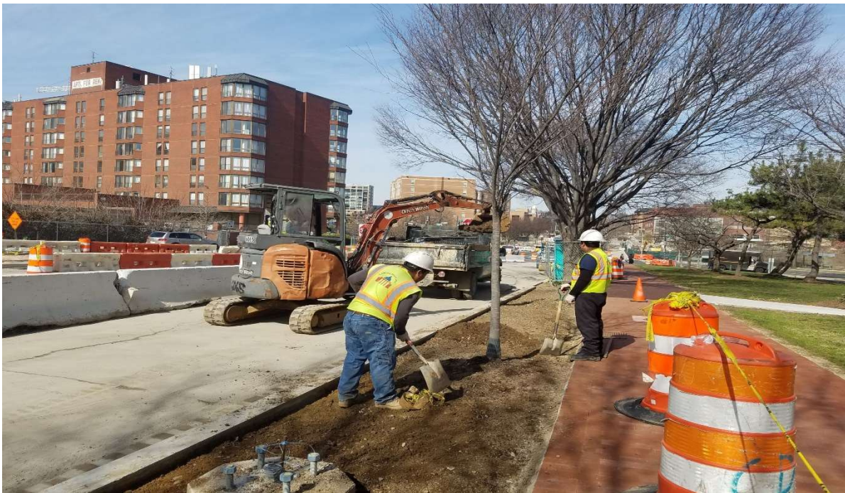
02/17/2020- Top soil placement for sodding base at East side of NJ Ave. b/n K & I St. NW (North view)