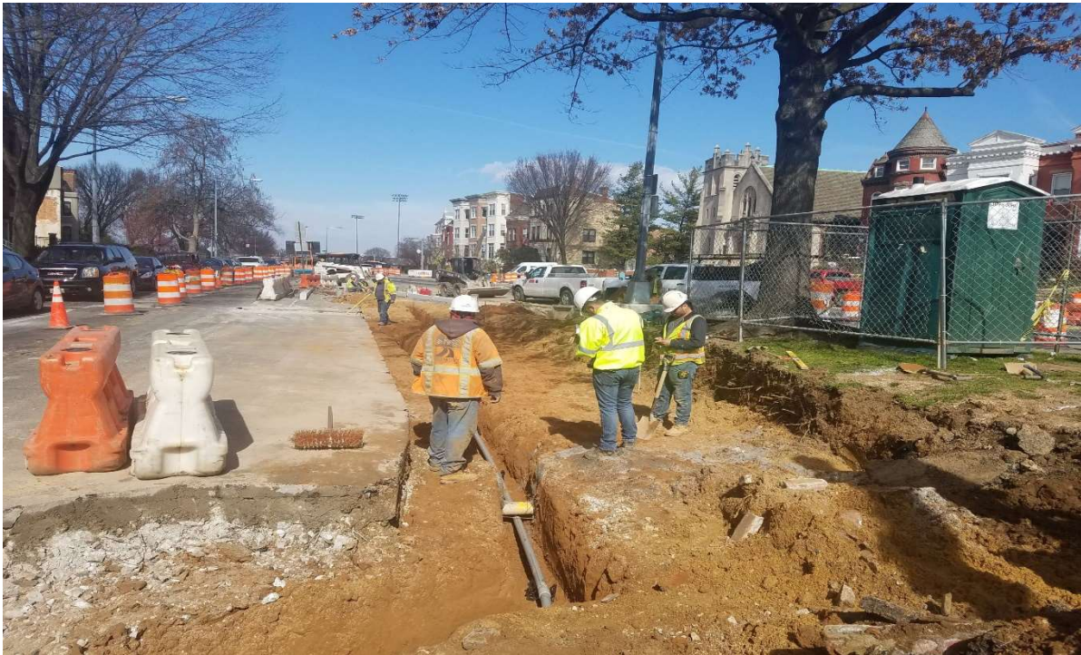
02/18/2020 – Conduit installation at west side of NJ Ave. NW. b/n M & Morgan St. NW (North view)