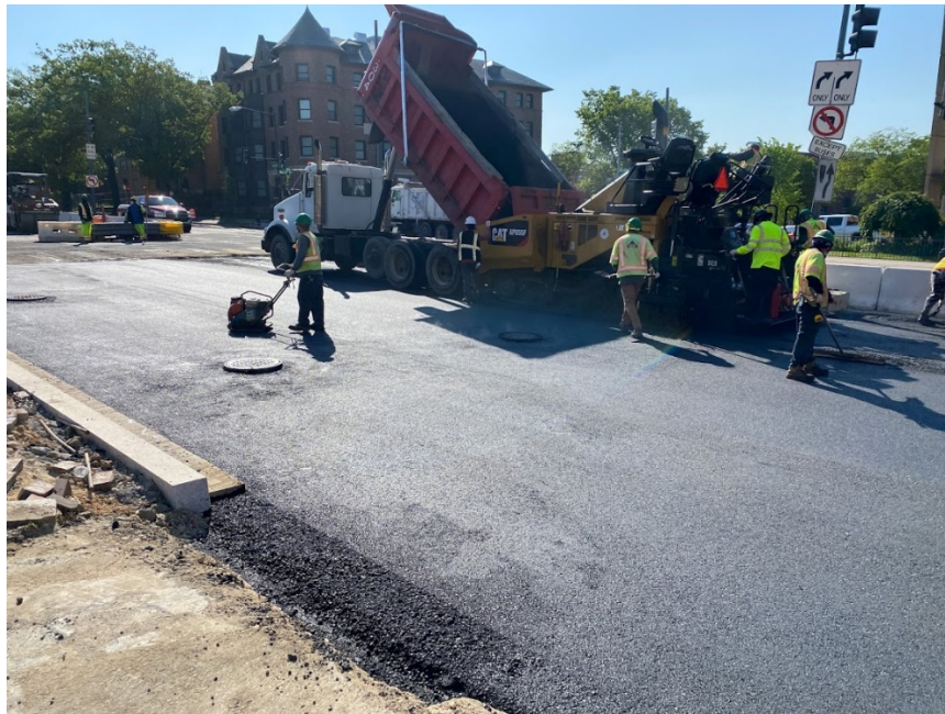
Picture No. 9 – 05/13/2020 – Placement of 12.5mm surface asphalt at intersection NY Ave. between NJ Ave NW and 3 rd St (South View)