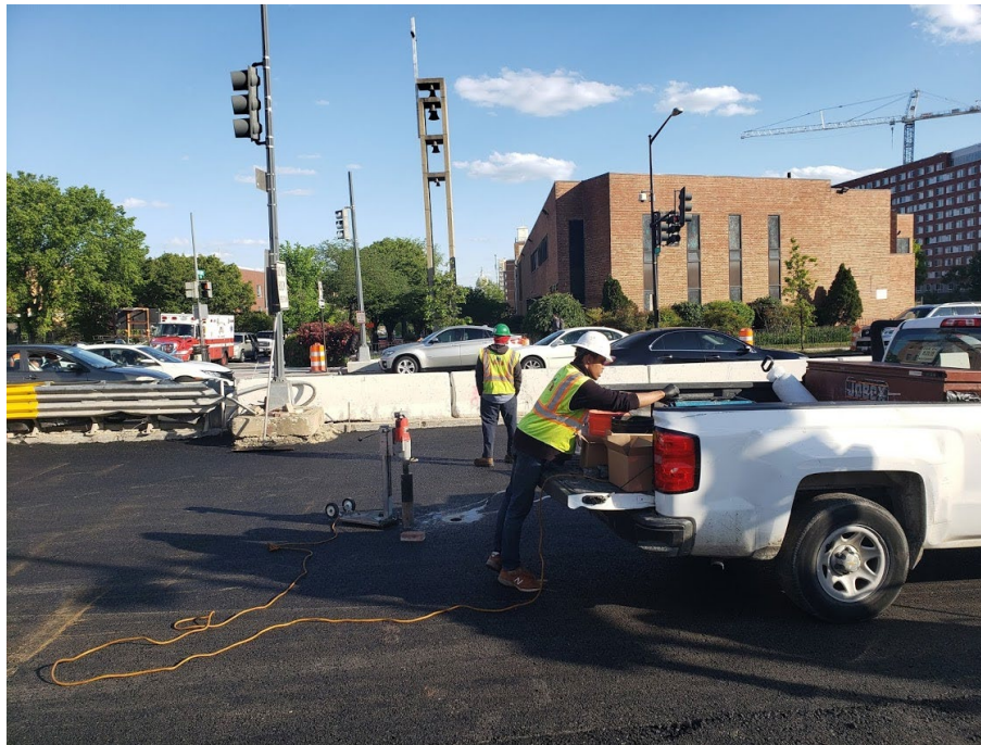
Picture No. 7 – 05/12/2020 – Random core samples collected at NW corner of NY Ave NW and NJ Ave NW (South View)