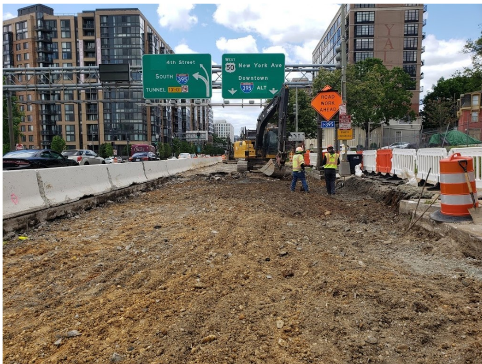
Picture No. 4 – 05/12/2020 – Full depth excavation underway at NY Ave. between 3rd St. and 4th St. NB. (West View)