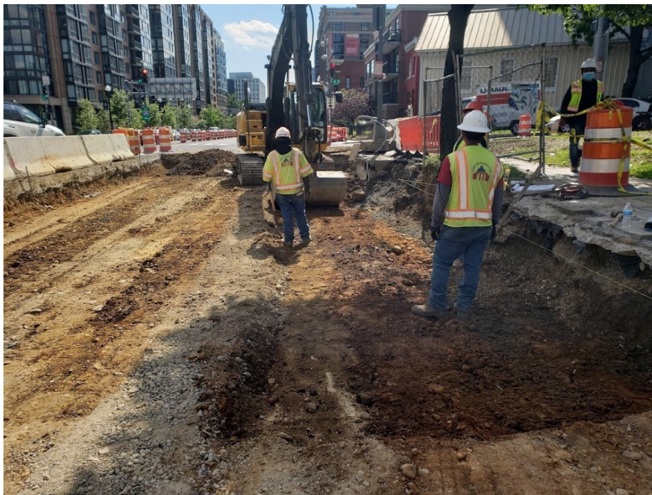
Picture No. 8 – 05/13/2020 – Full depth excavation and section of undercut performed at NY Ave. between 3rd St. and 4th St. (East view)