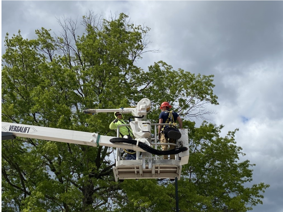
Picture No. 3 - 05/11/2020 – Installation of streetlight decorative arm at NJ Ave between I St. and K St. NW (North View)