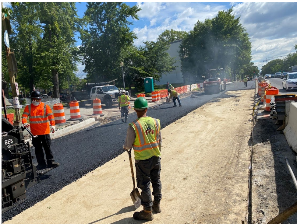
05/12/2020 – Placement and compacting of 25mm base asphalt at NY Ave near Kirby St NW (East View)

Project Website: www.newjerseyaverehab.com