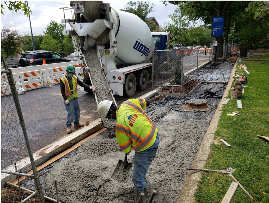
Picture No. 11 – 05/14/2020 – Concrete pour for PCC base of block sidewalk at NY Ave. between 1st St. and Kirby St. NB. (East View)