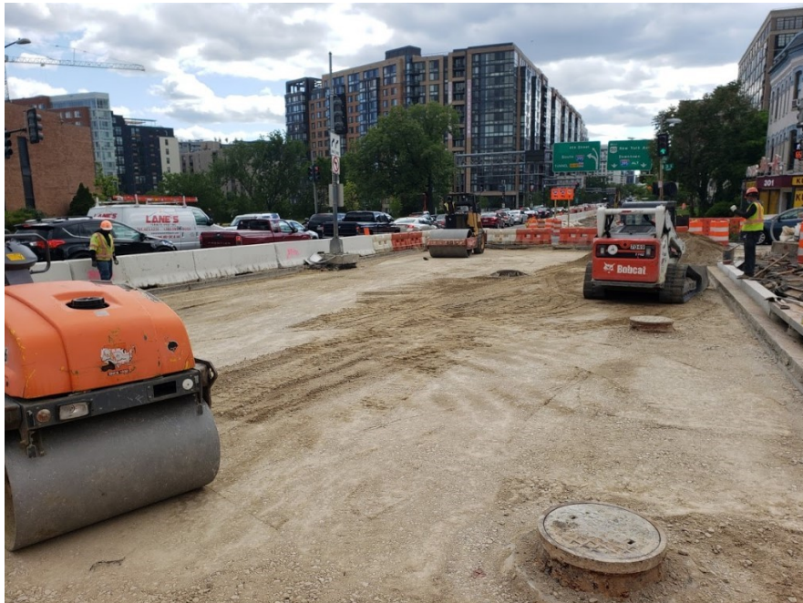
Picture No. 2: 05/11/2020 – Compaction and rolling of the subbase layer underway at NY Ave. between NJ Ave. and 3rd St. NB. (West View)