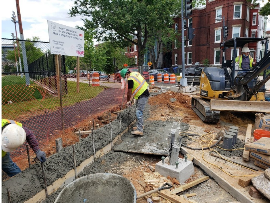
Picture No. 1: 05/11/2020 – Coping wall concrete pour underway at the NW corner of NY Ave. and 1st. St. (North View)