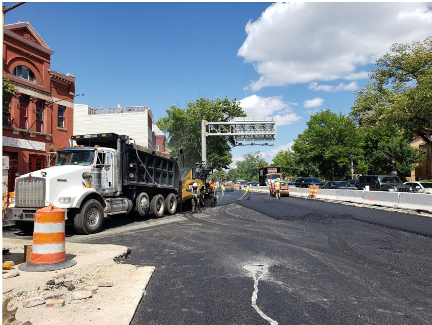
Picture No. 6 – 05/12/2020 – Second lift of 25mm base asphalt paving continued at intersection NY Ave. and M St. (East view)