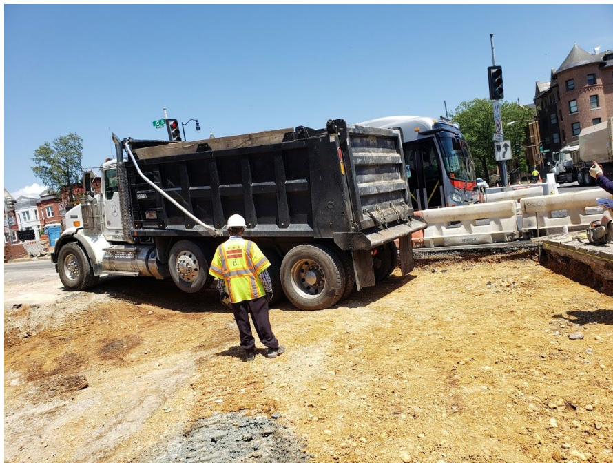
Picture No. 14 – 05/15/2020 – Proof rolling and probing performed by DDOT technician at NY Ave. between 3rd St. and 4th St. NB. (West View)