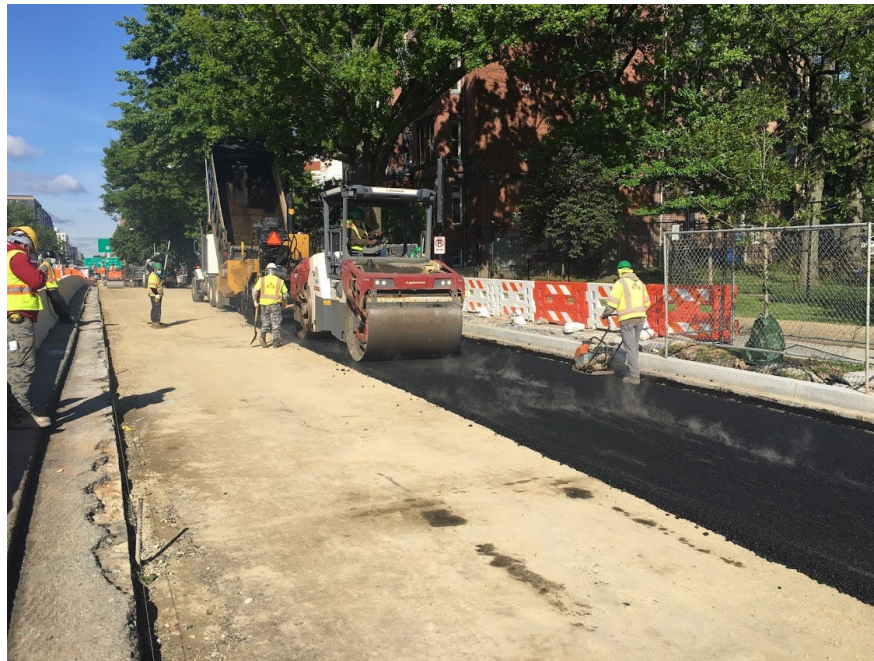
Picture No. 5 – 05/12/2020 – Placing and compacting first lift of 25mm base asphalt at NY Ave between First St and Kirby St (West View)