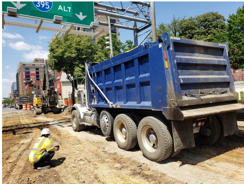
Picture No. 10 – 05/13/2020 – Proof rolling and probing performed by DDOT technician at NY Ave. between 3 rd St. and 4 th St. NB. (West View)