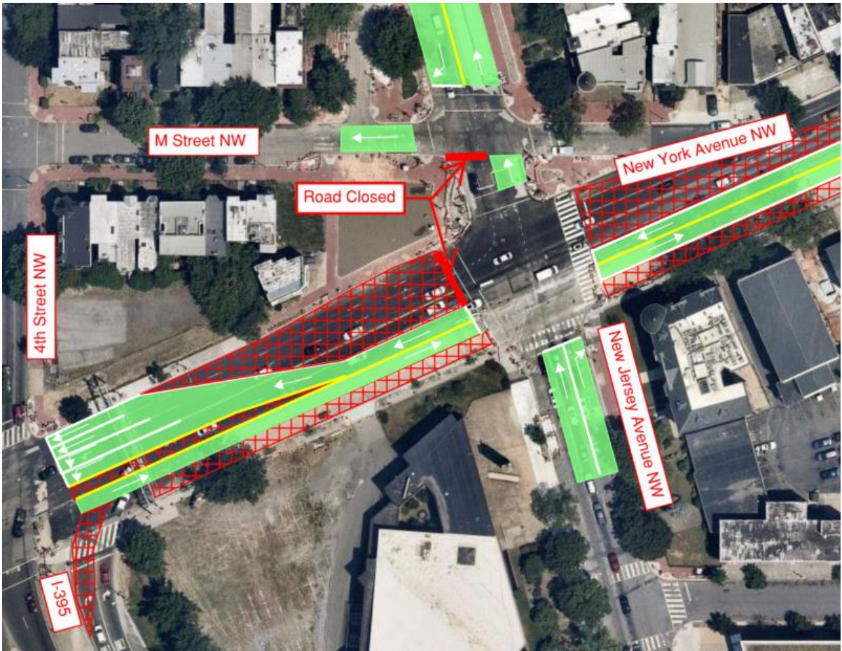
Figure 2: Westbound Detour at New York Ave NW and New Jersey Ave NW