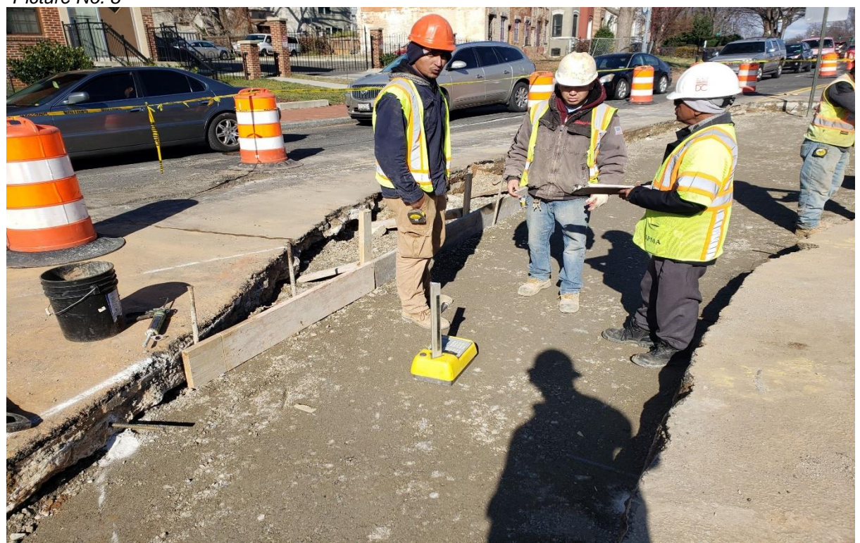
02/08/2020- Moisture Density Test for the bus pad at West side of New Jersey Ave. & N St. NW.