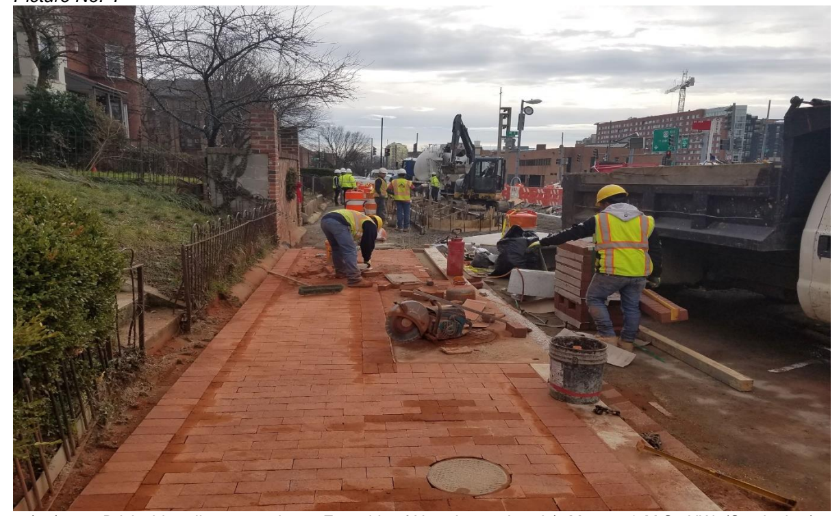
02/04/2020- Brick sidewalk construction at East side of New Jersey Ave. b/n Morgan & M St. NW. (South view)