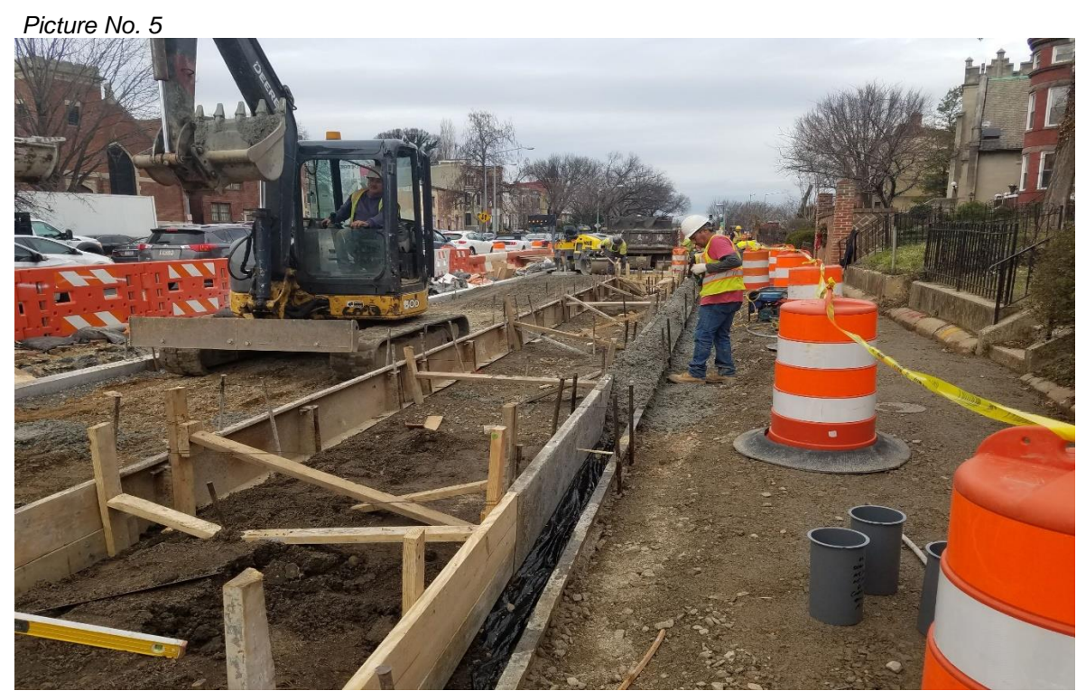
02/04/2020- Copying wall construction for the island at East side of NJ Ave. NW, north of M St. (N. view) Picture No. 6