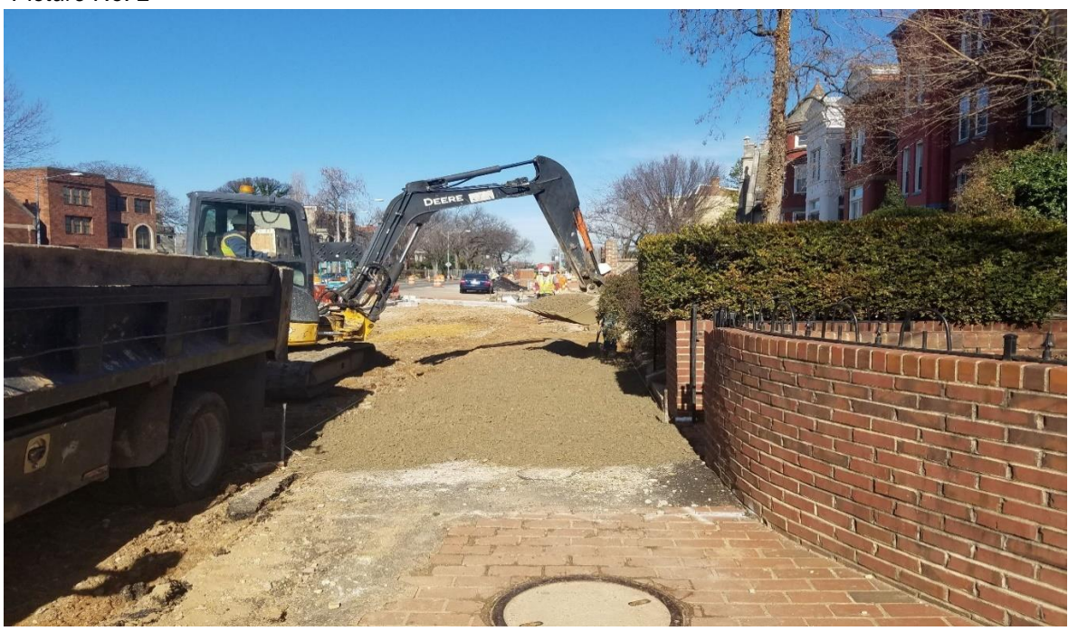
02/03/2020- GAB placement for sidewalk at East side of NJ Ave. NW b/n NY Ave. and Morgan St. NW. (N. view)