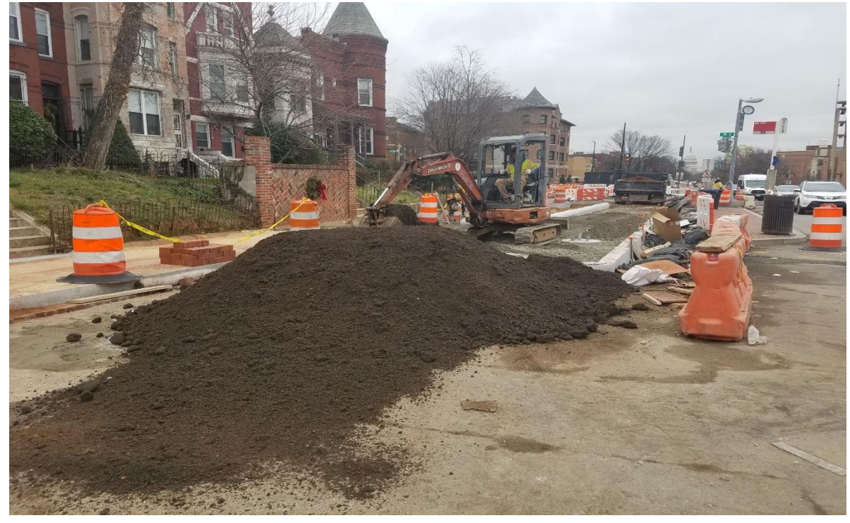
02/04/2020- Soil backfill for Island at/near NE corner of New Jersey Ave. & M St. NW (South View)