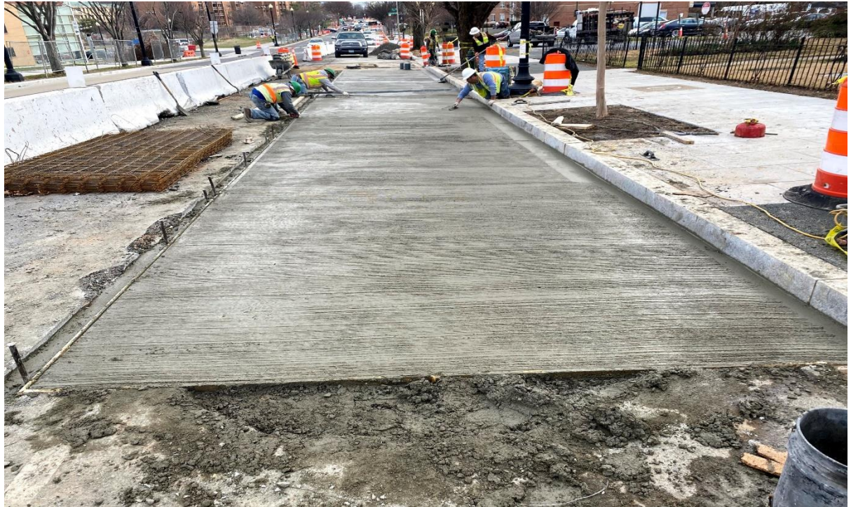
02/08/2020- Finishing work on PCC bus pad constructed at West side of NJ Ave. NW Near Pierce St. (South View)