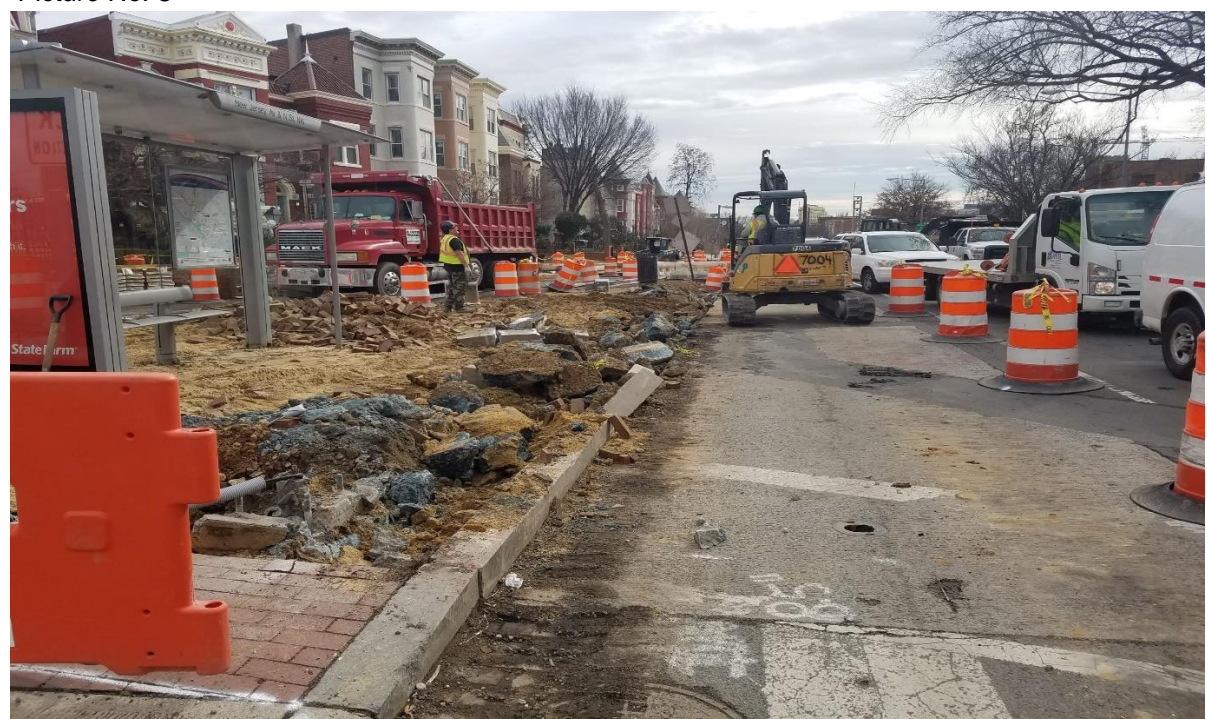
02/04/2020 – Removal of existing curb & island at/near New Jersey Ave. & 3^{rd} St. Intersection. (South View) Picture No. 4