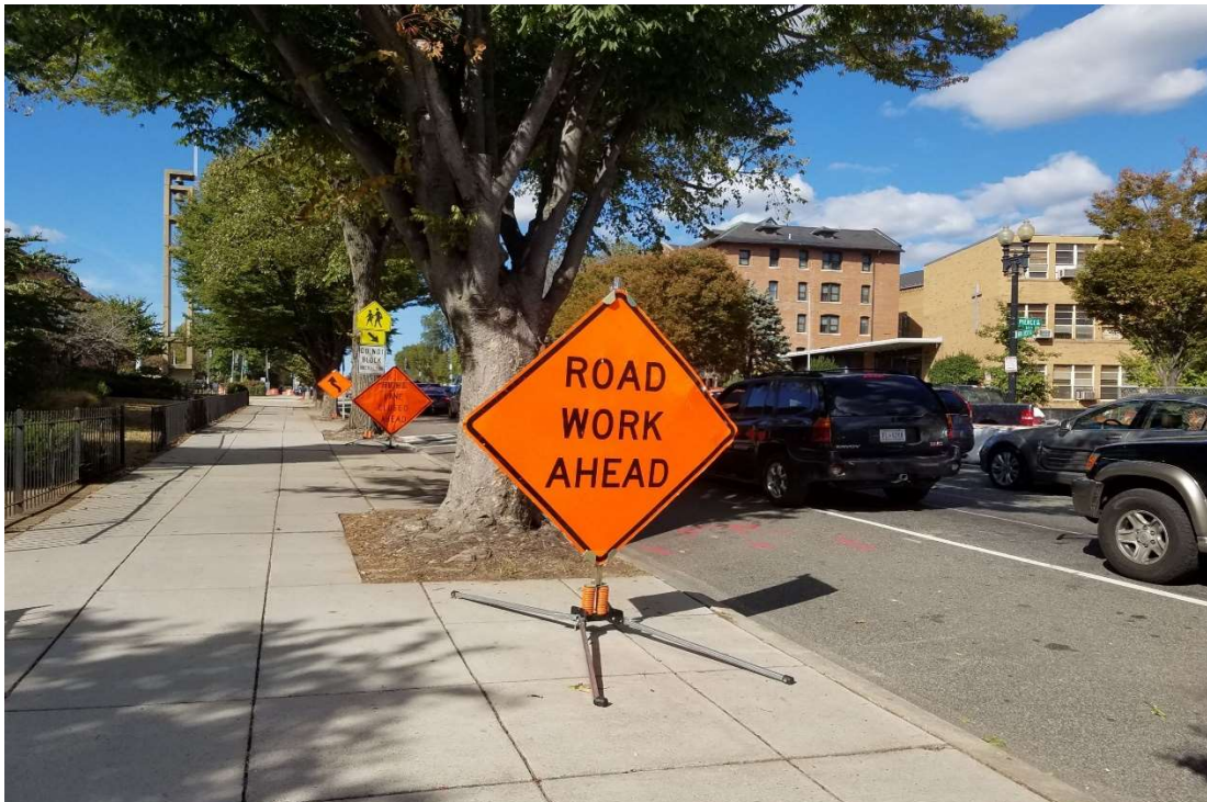
10/10/2019- MOT Signs set up at west side of NJ between Pierce St. and New York Ave. (North view)