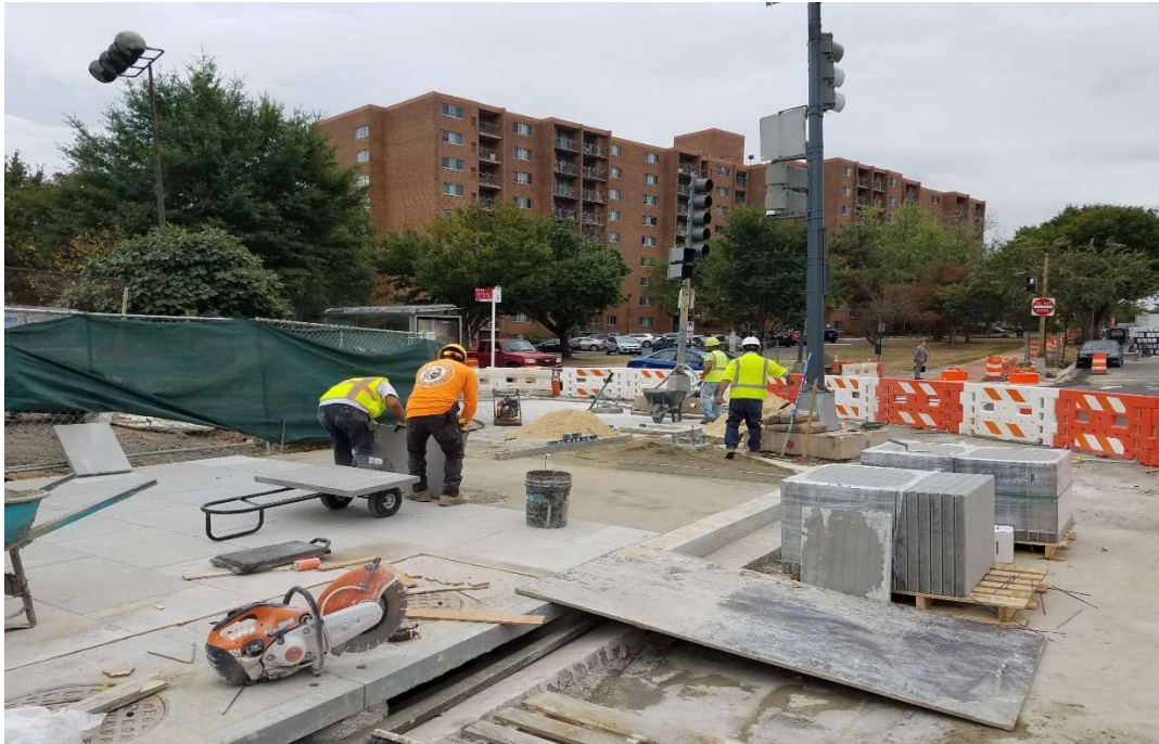
10/08/2019- Installing Block Paver for Sidewalk at NE corner of NJ & K St. NW. (Southeast View)