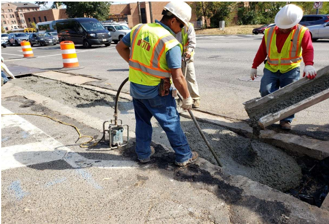
10/09/2019-Concrete pouring PCC base for utility conduits at north side NY Ave & 4 th St. NW. (SE View)