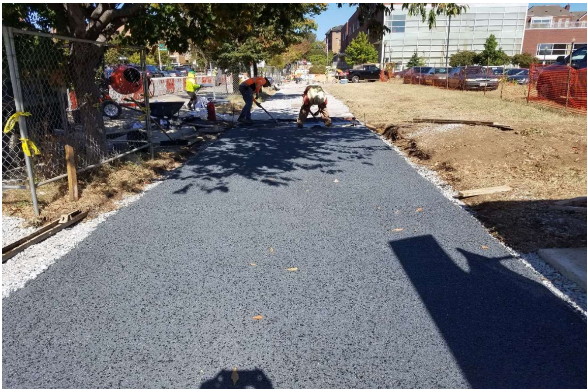
10/11/2019 – Flexi-pave construction for sidewalk near tree roots at East side of NJ Ave. Sta. 115+00

Project Website: www.newjerseyaverehab.com