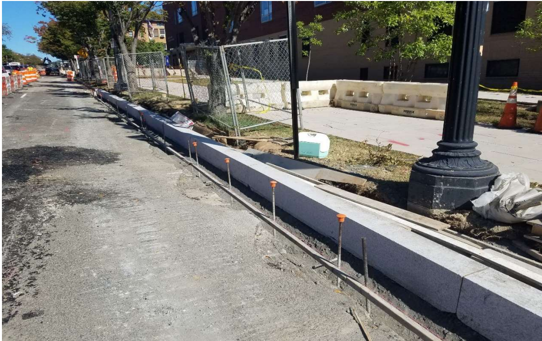
10/11/2019- Installed Granite Curb at East side of NJ Ave. NW between L & Pierce St. NW. (North View)