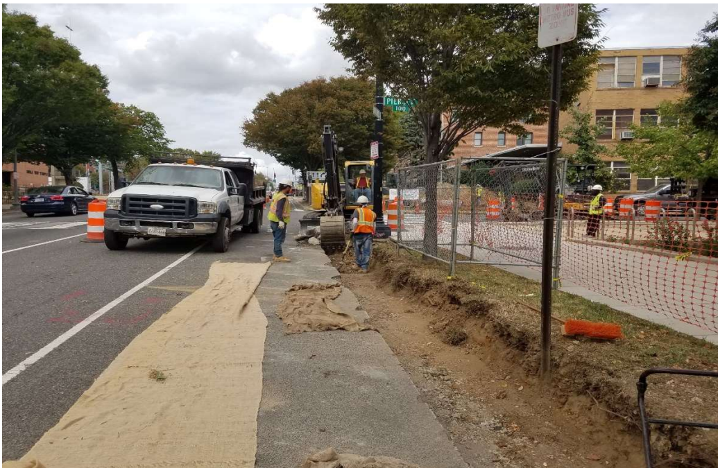
10/07/2019- Excavation for curb & gutter at East side of NJ Ave. btwn L & Pierce St NW. (North View)