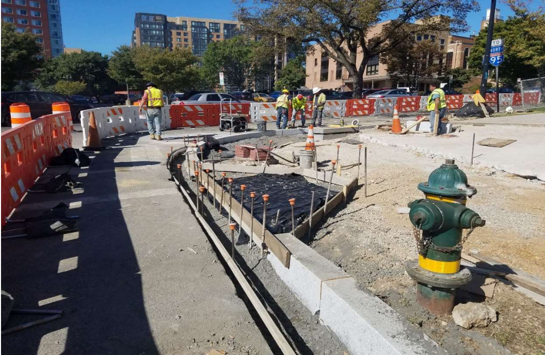
10/11/2019- Layout/Form working for Wheelchair Ramp at NE Corner of NJ & L St. NW (NW view)