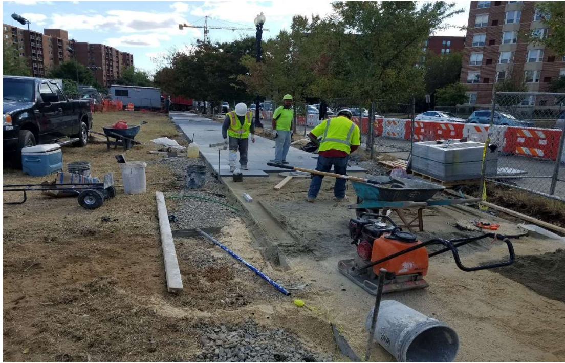
10/10/2019- Installing Block pavers for sidewalk at East side of NJ Ave. btwn K & L St. NW (Southview)