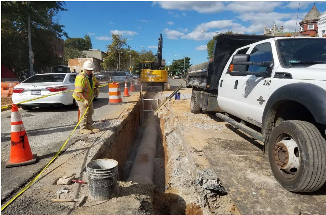
10/10/2019 – Installed 18" RC storm water pipe from str. F4 to F2, b/n M and Morgan St. NW (North view)