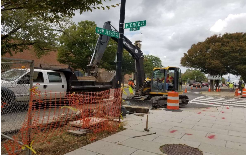
10/07/2019- Excavation for Structure M3 installation at NE corner of NJ & Pierce St. NW (North View)